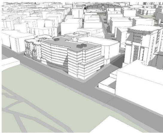
3/24/2021 10:51:00 AM NORTH EAST