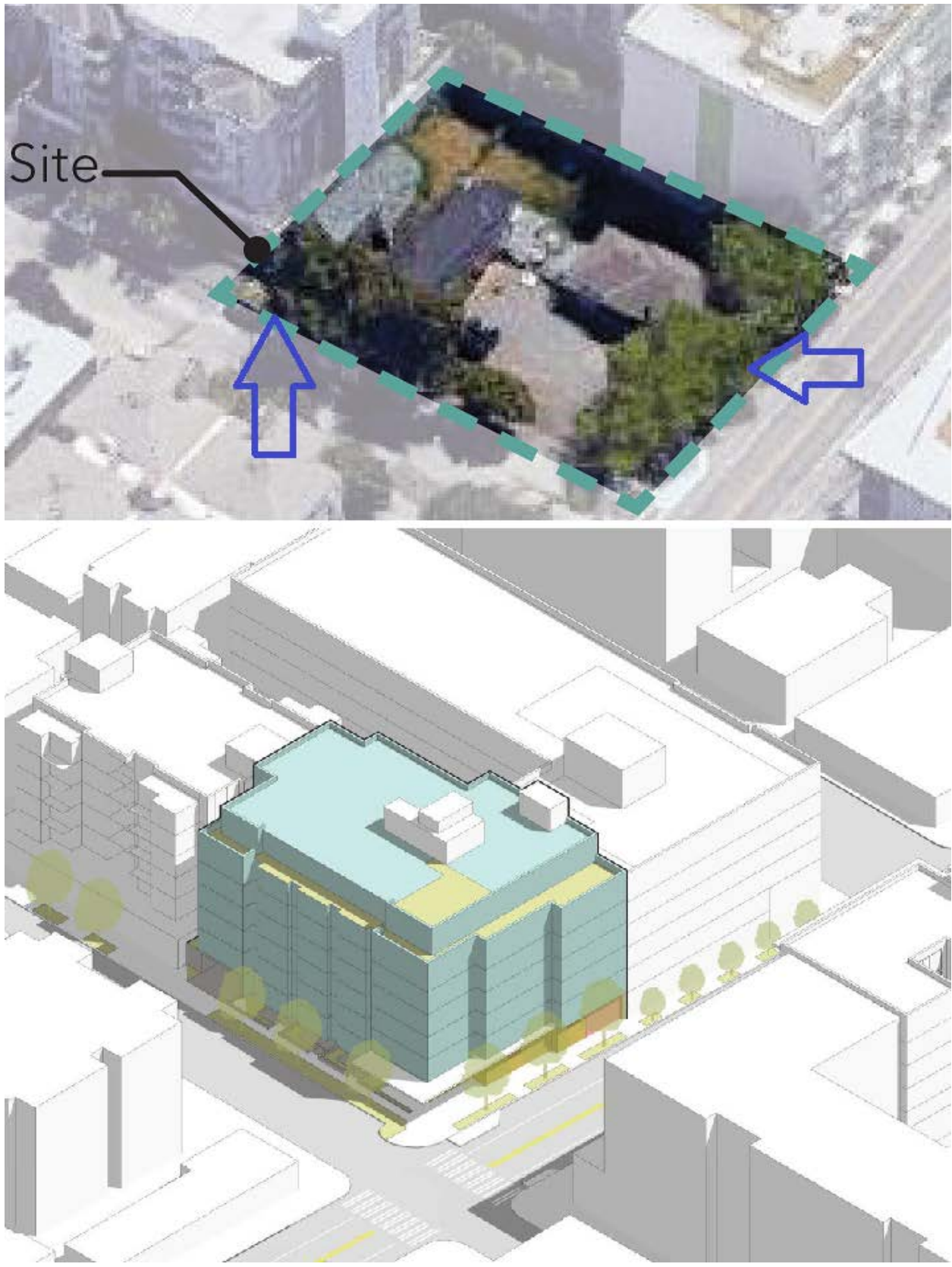
7. Amenity Area (SMC 23.47A.024) Please provide dimensions on all proposed amenity areas in plans. SMC 23.47A.024.B.4 and B.5