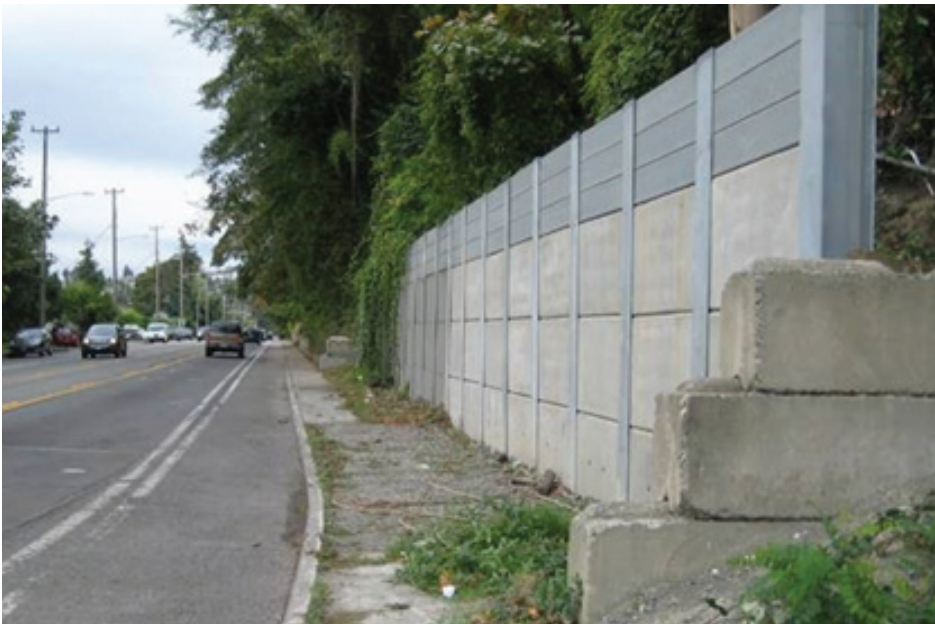
Example retaining wall on Rainier Ave S at S Perry St

Starting in early 2020, and continuing through early fall, we will construct retaining walls at the locations outlined within the map below. Crews may complete preliminary work in December 2019.