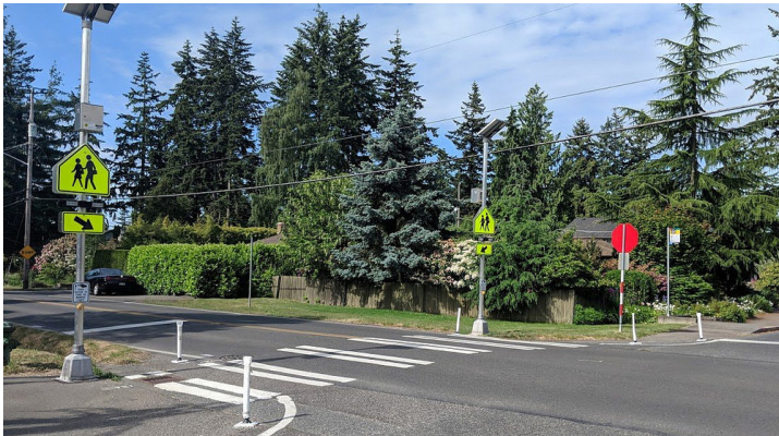
N 50th St will soon have rapid flashing beacons at Dayton Ave N and at Woodland Park Ave N.