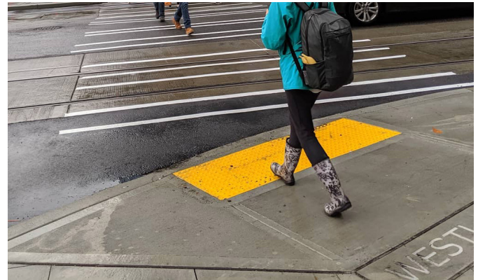
New and upgraded curb ramps at many intersections along N 50th St.