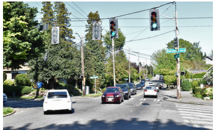
Repaving N 80th St to create a smoother drive for people accessing I-5 and Aurora Ave N.