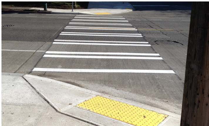
New or upgraded curb ramps at some intersections along N 80th St.