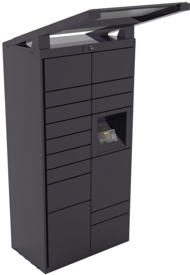
Company locker delivery systems