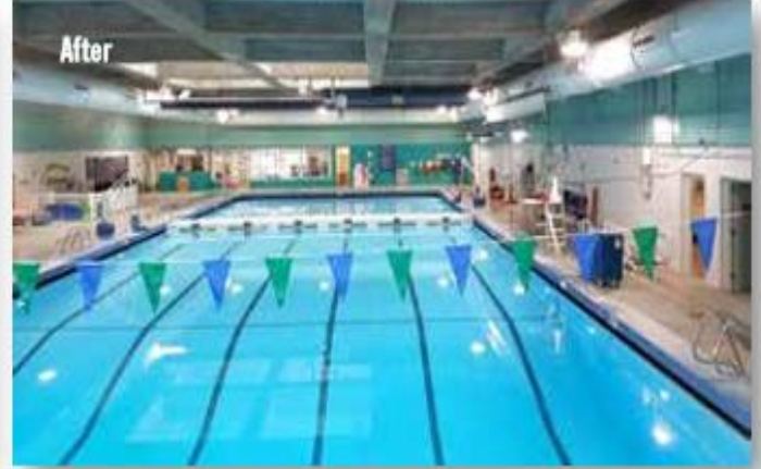
MEDGAR EVERS POOL PROJECT