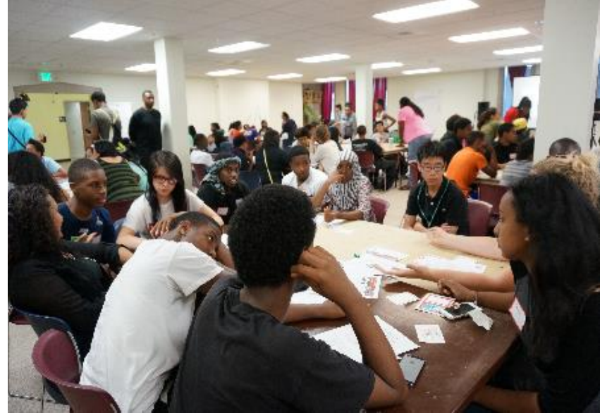
Community Center Plan Teen Meeting