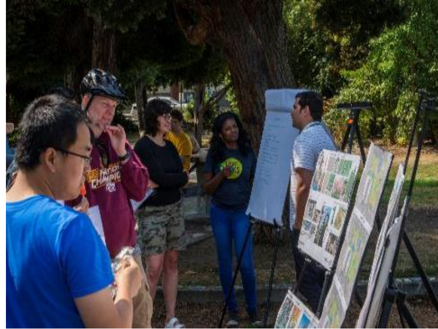
Baker Park on-site community planning