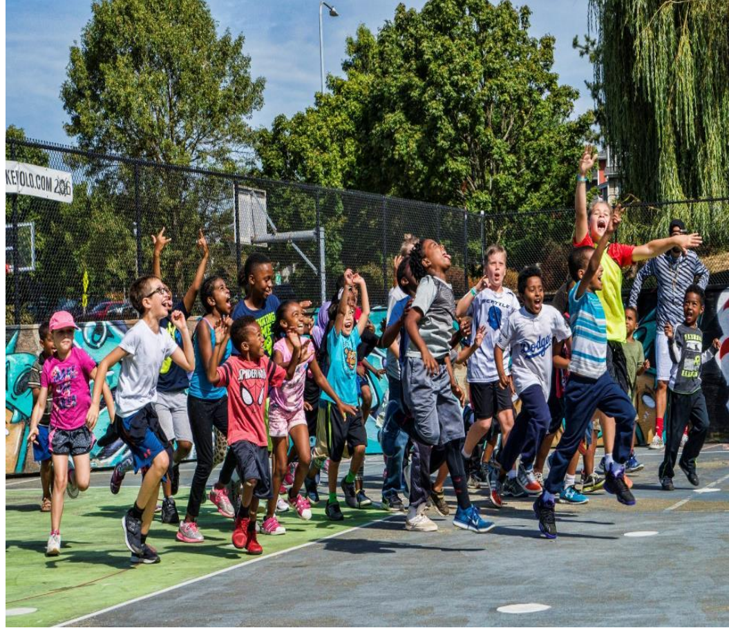
Futsal fun at Judkins Park