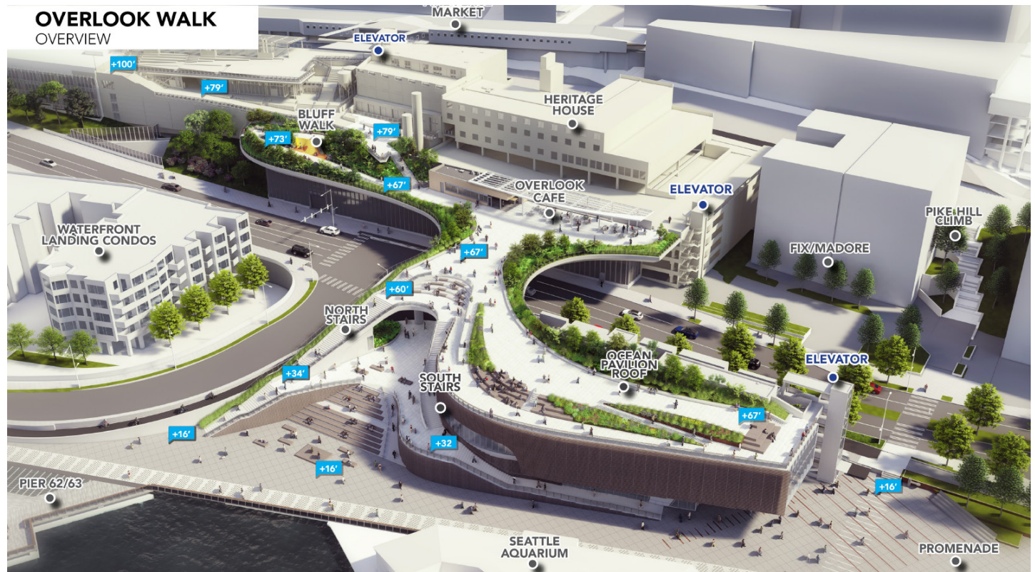
Figure 3: Proposed design of Overlook Walk