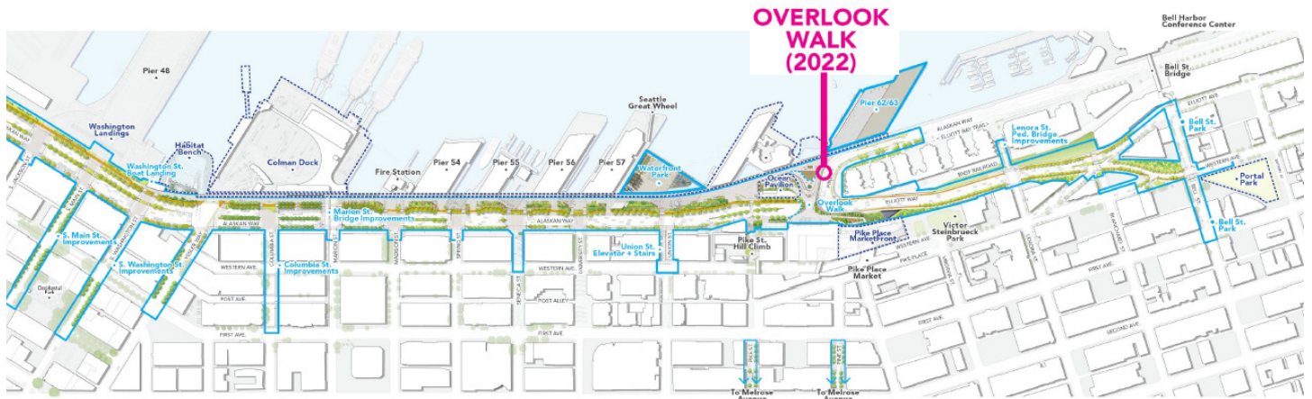
Figure 1: Project location