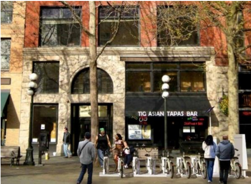
Plaza or open space