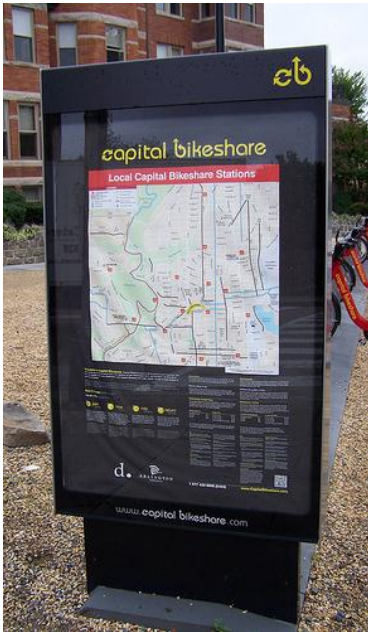
Informative, easy-to-use kiosks