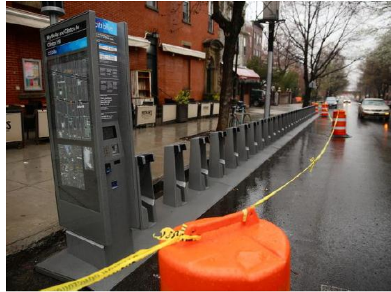
Replacement of on-street parking