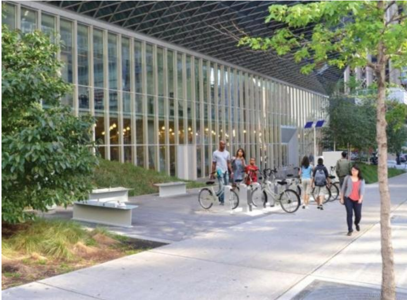
Public or private land