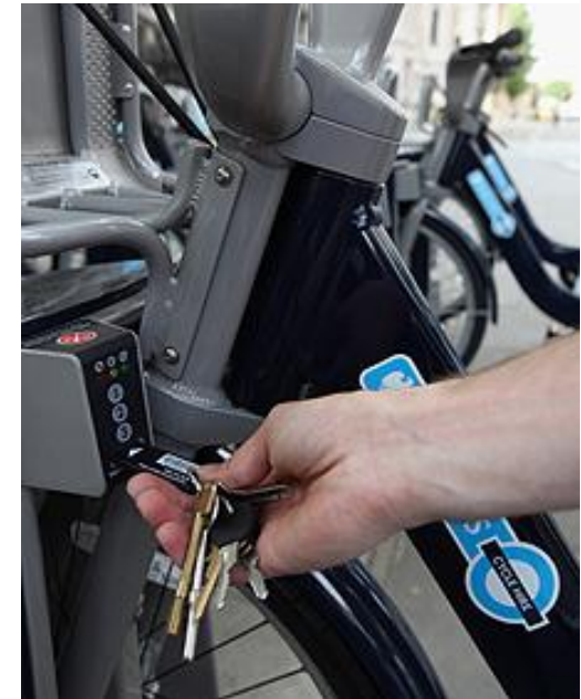
Convenient keycard access

Locates bike stations & displays bike & bike dock availability.