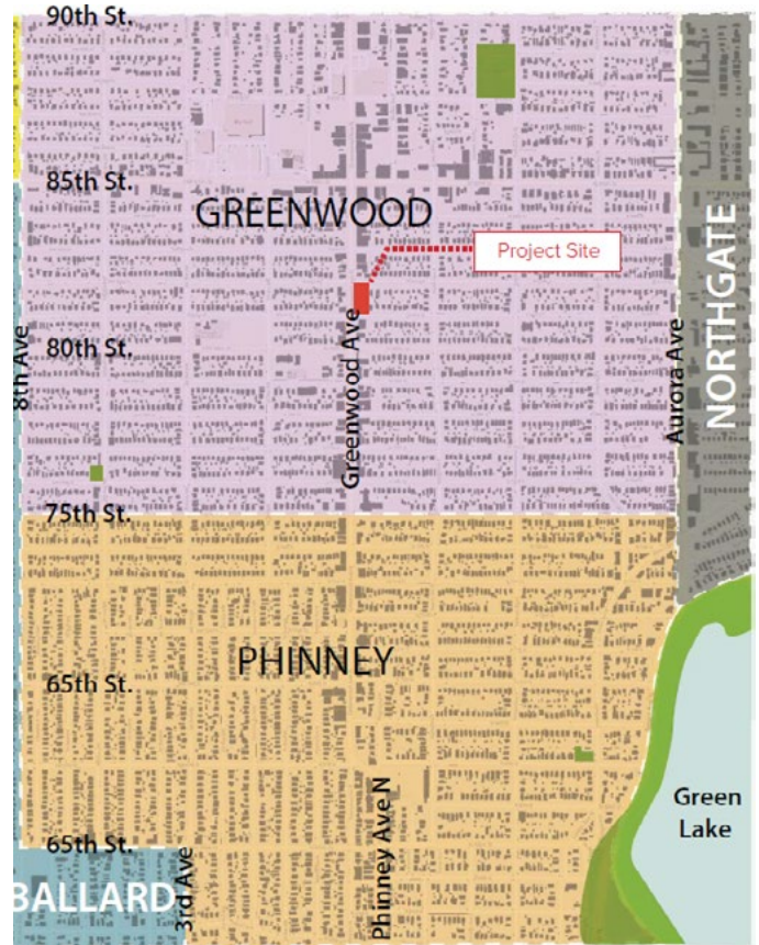
Figure 1: Site context map

Katie Bang, of Seattle Parks and Recreation (SPR), and Lisa Corry and David Bader, of Cascade Design Collaborative, presented the concept design for the Greenwood Phinney Landbanked Site. The original project proposal included development on one, 12,000 square foot (sf) parcel (south parcel) as well as street improvements to Greenwood Ave N and N 81st St. Recently, SPR has acquired the parcel (north parcel) immediately to the north of the original park site. An updated project plan was created to include development on the additional parcel as well as additional street improvements along Greenwood Ave N and N 82nd St. Seattle Department of Transportation is funding a raised crosswalk crossing N 81st St at the intersection of Greenwood Ave N and 81st St, which will connect the park with the existing Greenwood Library.