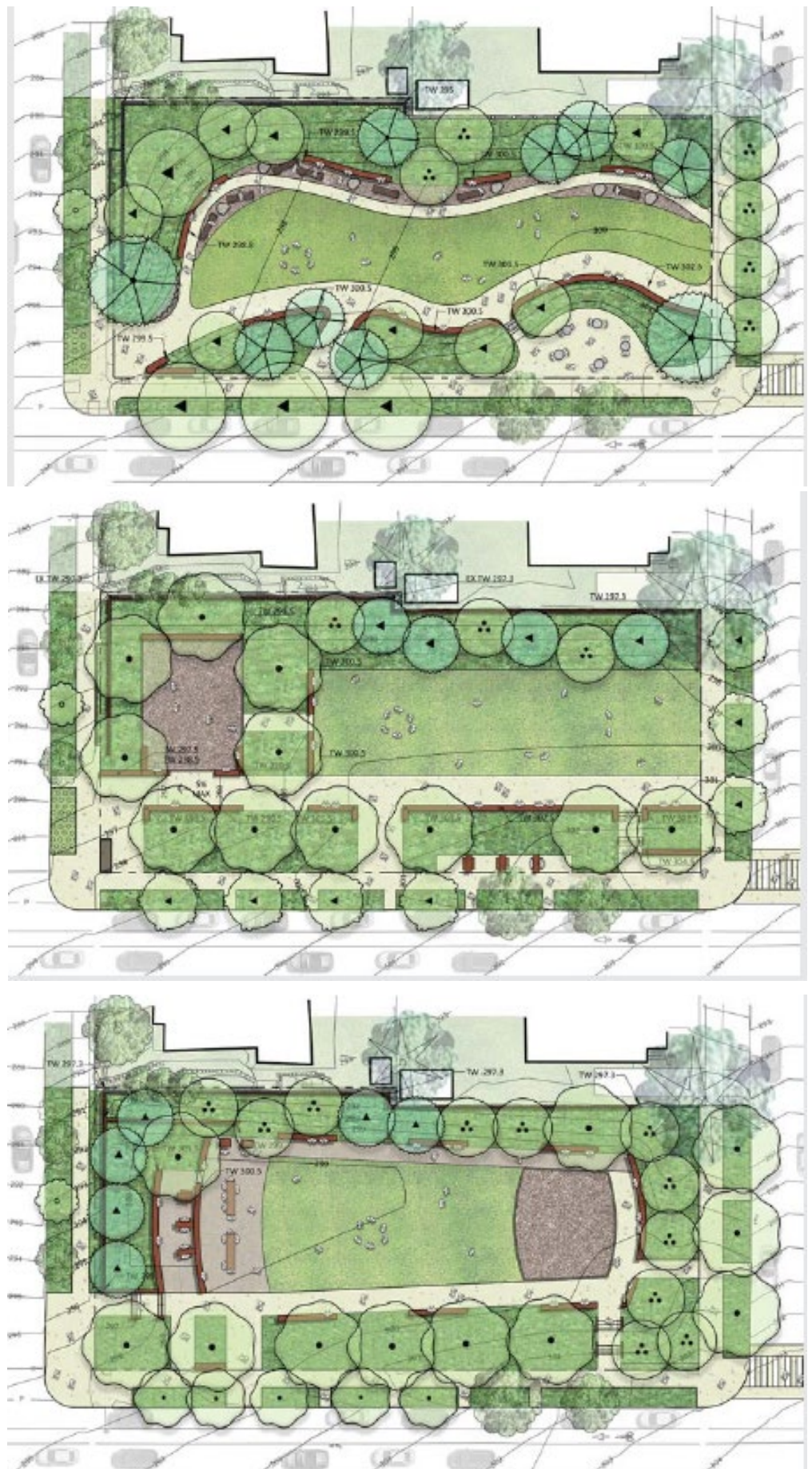
Figure 3: Proposed concept design alternatives option 1(top), option 2(middle) and option 3 (bottom)

Joanna D'Asapo , Friends of Library Park, stated that the