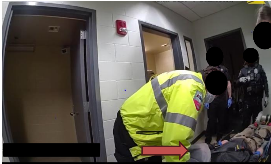
AMR Staff Placing Spit Sock over the Complainant's head. (red arrow)

WO#1 was a backing officer and walked to the AMR gurney and followed the AMR to HMC and conducted hospital guard of the Complainant. WO#2 responded to assist with the Complainant's transport to HMC and stood by on hospital guard until he was relieved at 2304 hours. The Complainant was booked into KCJ for two counts of felony investigation assault three.