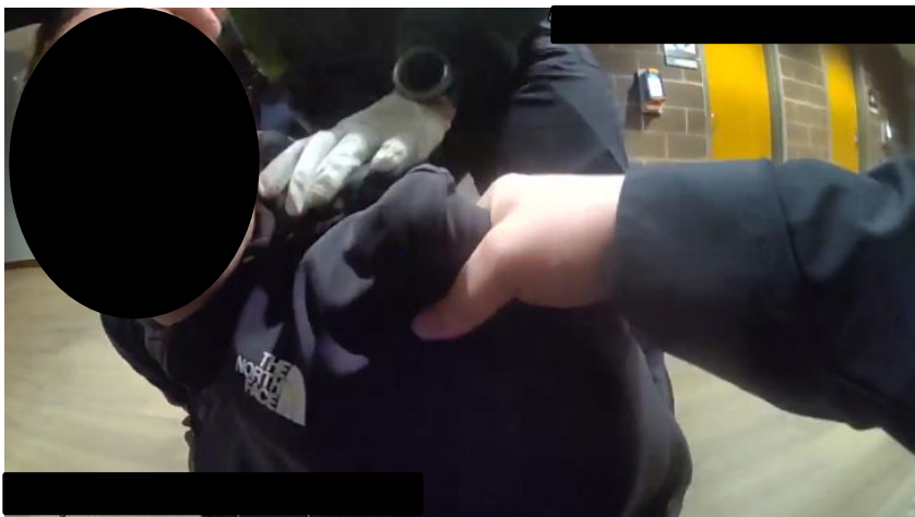
BWV shows the Complainant held up right by NE#1 and WS#1 while stating, "they're choking the shit out of me." BWV does not show the Officers choking the Complainant.