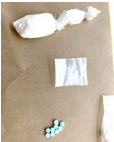
Photo of Recovered Suspected Illegal Narcotics

The Complainant awoke and reversed into NE#3's police cruiser hard enough for his trunk to unlatch.