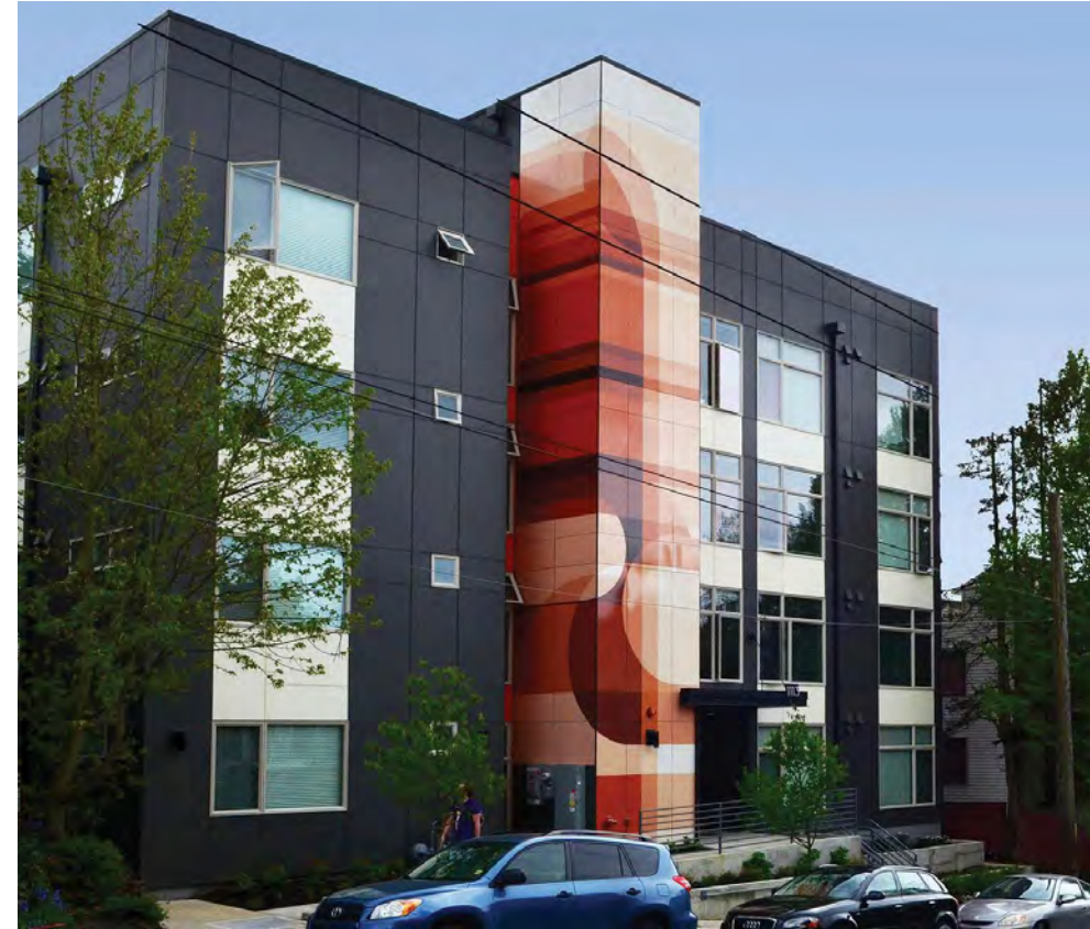
LIV - 1113 East John, Seattle