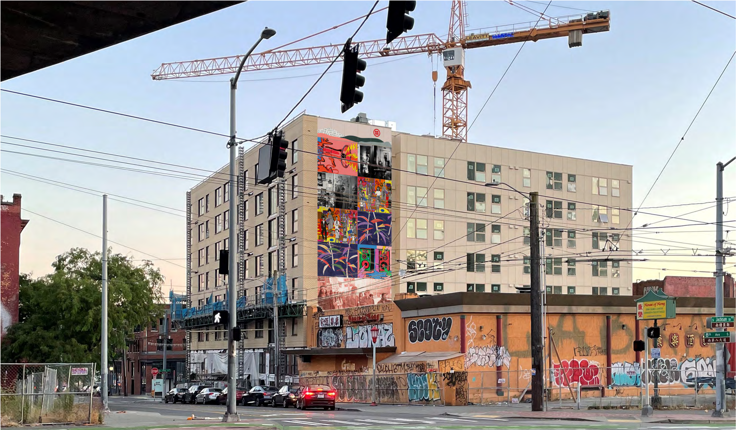
Street Level View from 8th Ave. S & S. Jackson St (NE Intersection)