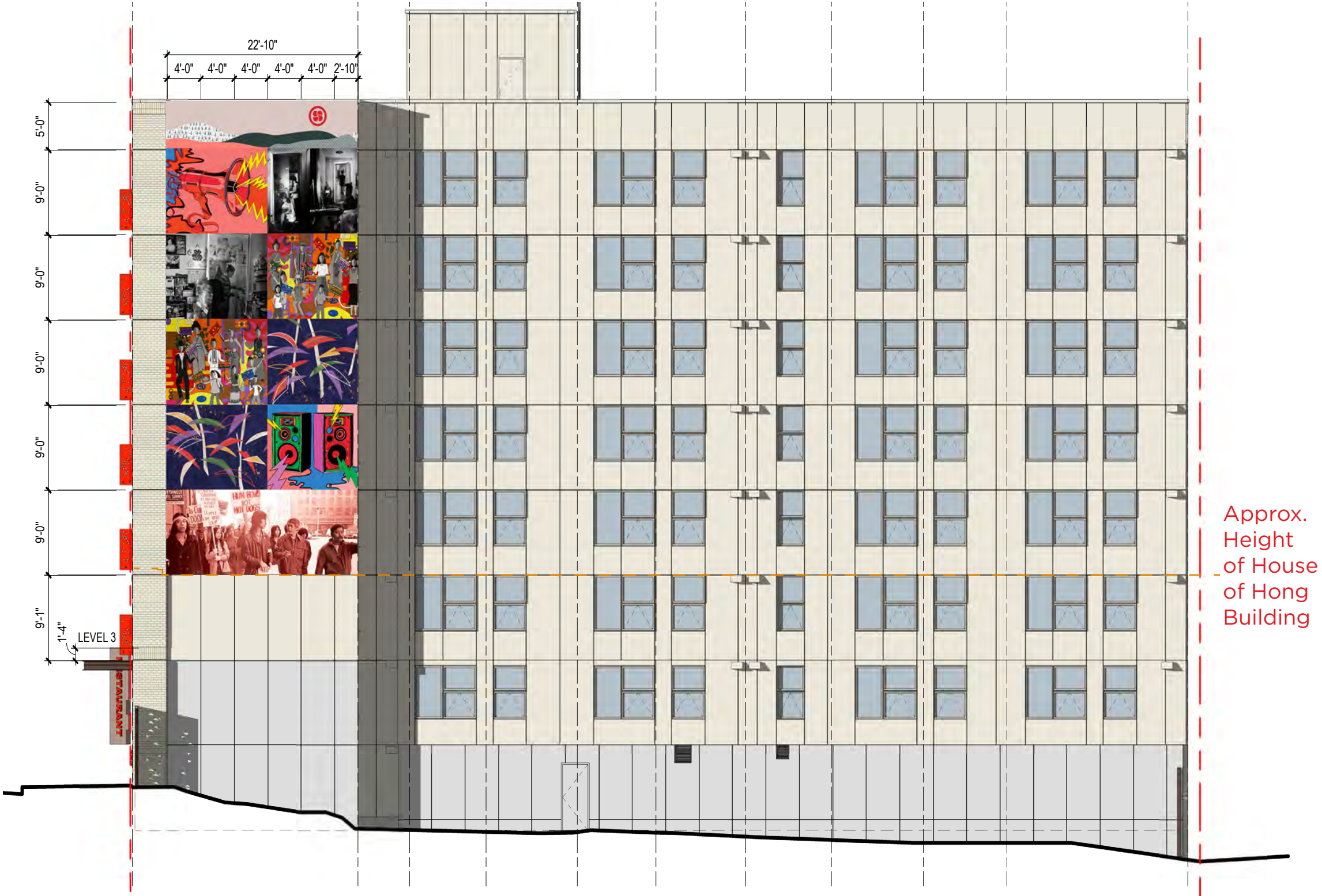
North Elevation - North Mural Location