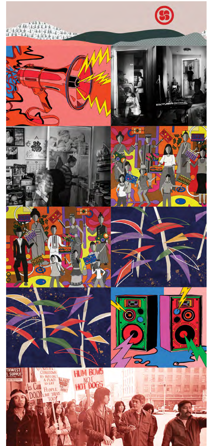
North Mural Overall Layout