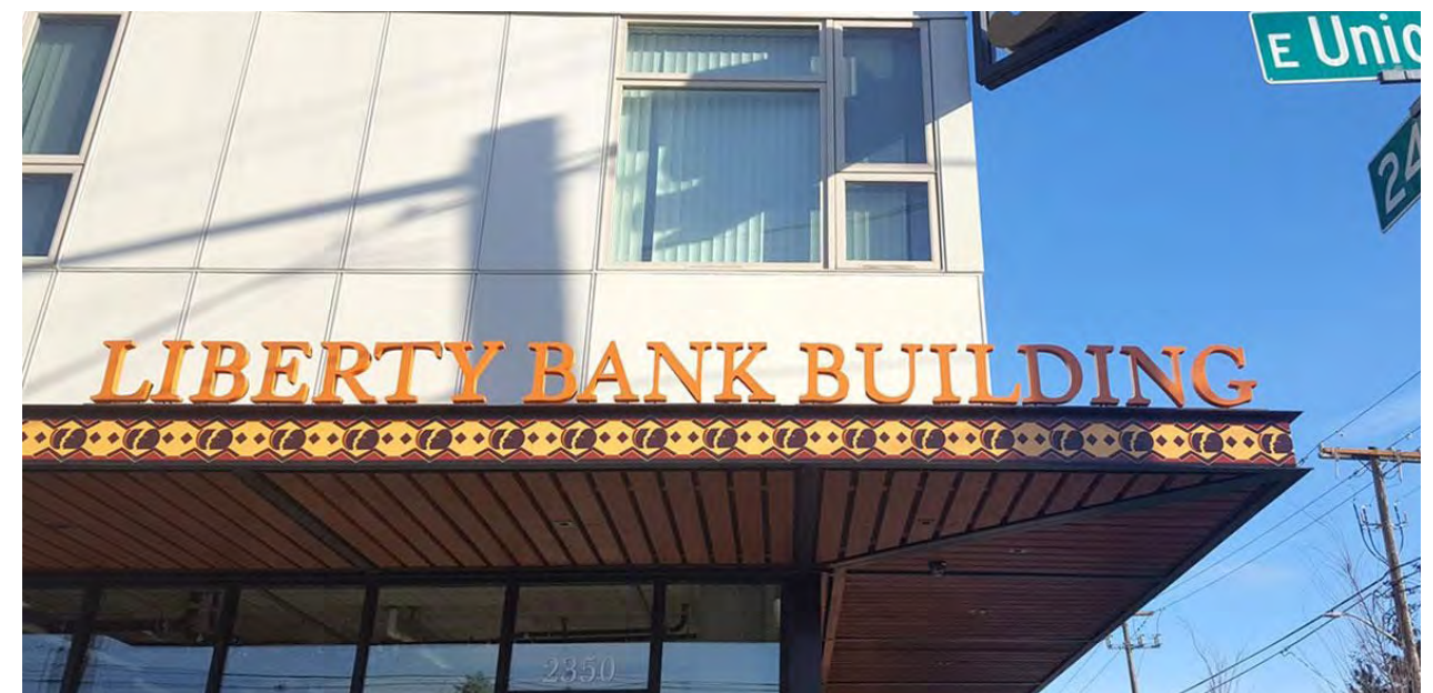
Liberty Bank Building - (Canopy C-Channel) 1405 24th Ave, Seattle