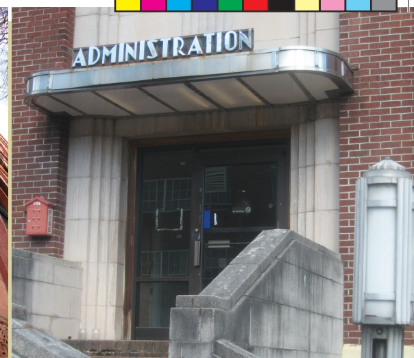
Sand Point Naval Air Station Landmark District, Building 30