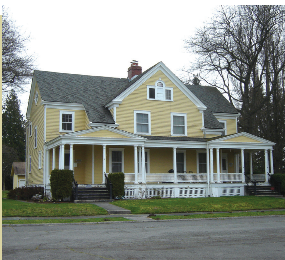
Fort Lawton Landmark District