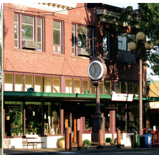
Columbia City Landmark District, Lions Building