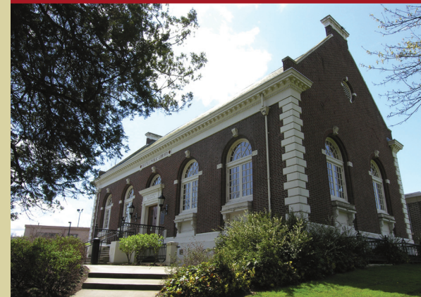
Columbia City Landmark District, Columbia Library