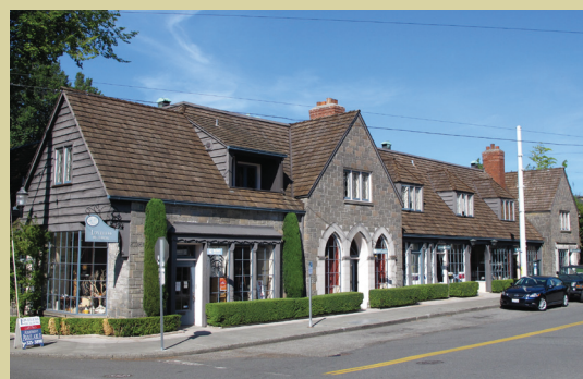
Harvard-Belmont Landmark District, Loveless Building

Before any alteration or significant change may be made to the exterior of a building or to an open space, street, alley, or right-of-way and before any new construction is implemented, a Certificate of Approval must be obtained from the Landmarks Preservation Board.