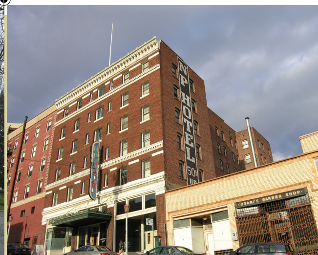
International Special Review District, NP Hotel