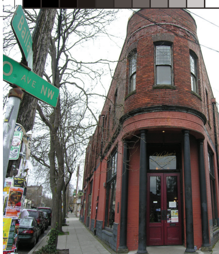
Ballard Avenue Landmark District, Junction Building