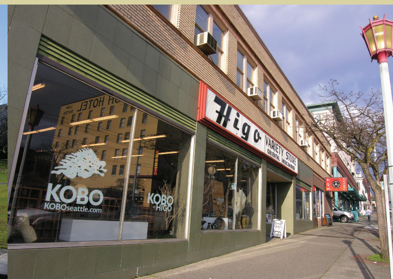
International Special Review District, Jackson Building