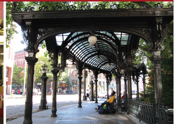
Pioneer Square Preservation District, Pergola

A national leader in historic preservation, Seattle has designated eight landmark or special review districts and more than 450 individual landmarks of national and local significance.