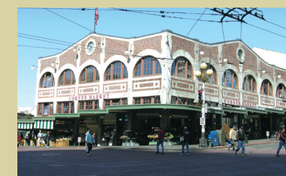
Pike Place Market Historical District

The 12-member Pike Place Market Historical Commission is responsible for the review and approval of applications for building permits and Certificates of Approval that involve demolishing, building, renovating, altering, modifying, improving, or otherwise changing any structure within the 10-acre District. A Certificate of Approval is also required for any changes in use within the District. The Pike Place Market Historical Commission guidelines are specifically designed to help preserve and improve the District.