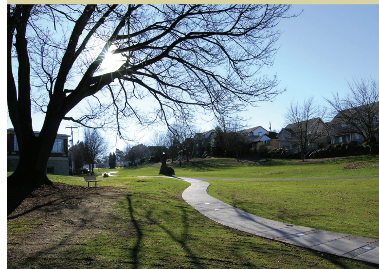
Columbia City Landmark District, Columbia Park

This program received Federal funds from the National Park Service. Regulations of the U.S. Department of Interior strictly prohibit unlawful discrimination in departmental Federally Assisted Programs on the basis of race, color, national origin, age, or handicap. Any person who believes he or she has been discriminated against in any program, activity, or facility operated by a recipient of Federal assistance should write to: Director, Equal Opportunity Program, U.S. Department of the Interior, National Park Service, 1849 C Street, NW, Washington, DC 20240.