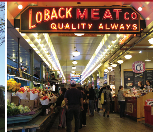
Pike Place Market Historic District, Market