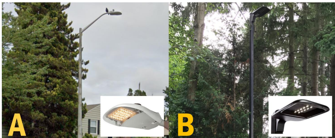
Option A: Cobrahead streetlight fixture and aluminum pole (current fixtures in neighborhood)

City Light is seeking community input on the streetlight design for this project. Customers can provide their feedback by completing our online survey at surveymonkey.com/r/columbialights . Responses will be collected until Sunday, November 15 at 11:59 p.m.