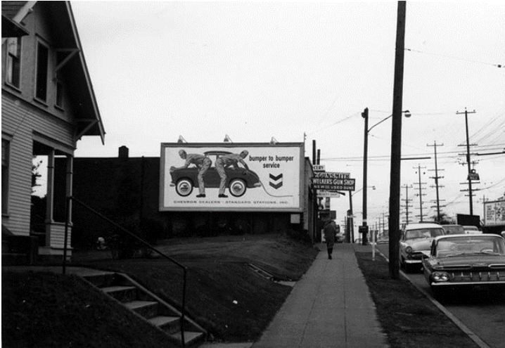
Billboard advertising Chevron near Welker's Gun Shop, 1962. Item 194185 , Record Series 1802-0P, SMA.

In 1962, the Washington Roadside Council submitted hundreds of photographs of non-conforming signs and billboards to City Council as part of a petition regarding amendment of the zoning code relating to signs. The petition is not in existence, but the photos submitted with the petition are being scanned and cataloged as part of Record Series 1802-0P .