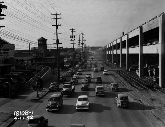
A view of Alaskan Way in 1952, at Marion looking north. Item 43556 , Record Series 2613-07, SMA.

A popular photo recently posted to SMA's Flickr site is this photo of the Alaskan Way Viaduct, looking north from Marion Street in 1952. A Flickr user commented, "I did not realize until seeing this picture how old the Viaduct was."