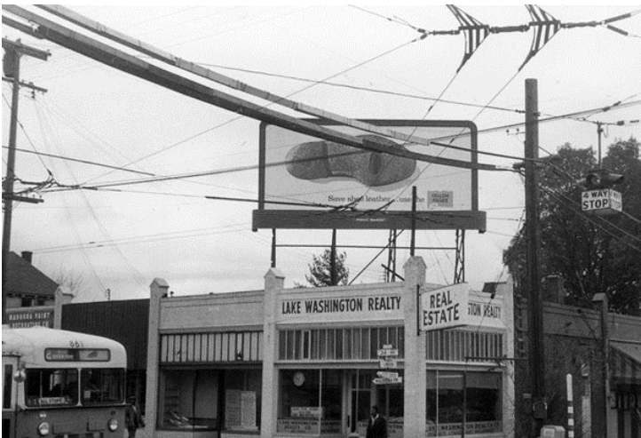
Billboard advertising the Yellow Pages at 34 th and Union, 1962. Item 194178 , Record Series 1802-0P, SMA.

As is frequently the case with photographs taken for a specific purpose, the images are useful for purposes other than the original one. Businesses, neighborhoods, and vehicles pictured in the images help inform our understanding of how Seattle neighborhoods have changed.