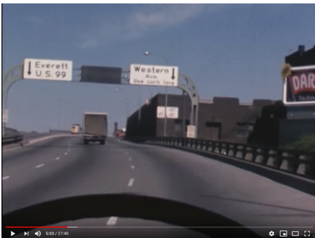
Alaskan Way Viaduct/Reconstruction of the Ballard Bridge, 1950/1940. Item 524 , Record Series 2613-09, SMA.

Continuing the theme, one of the most watched videos on SMA's YouTube channel with over 36,900 views is a 1950s Engineering Department film showing the Alaskan Way Viaduct. The film also includes footage of the restoration of the Ballard Bridge, and its reopening in 1939.