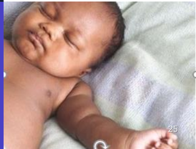
Photo credits: OSE Fresh Bucks (upper); stock image (lower right). Thank you!