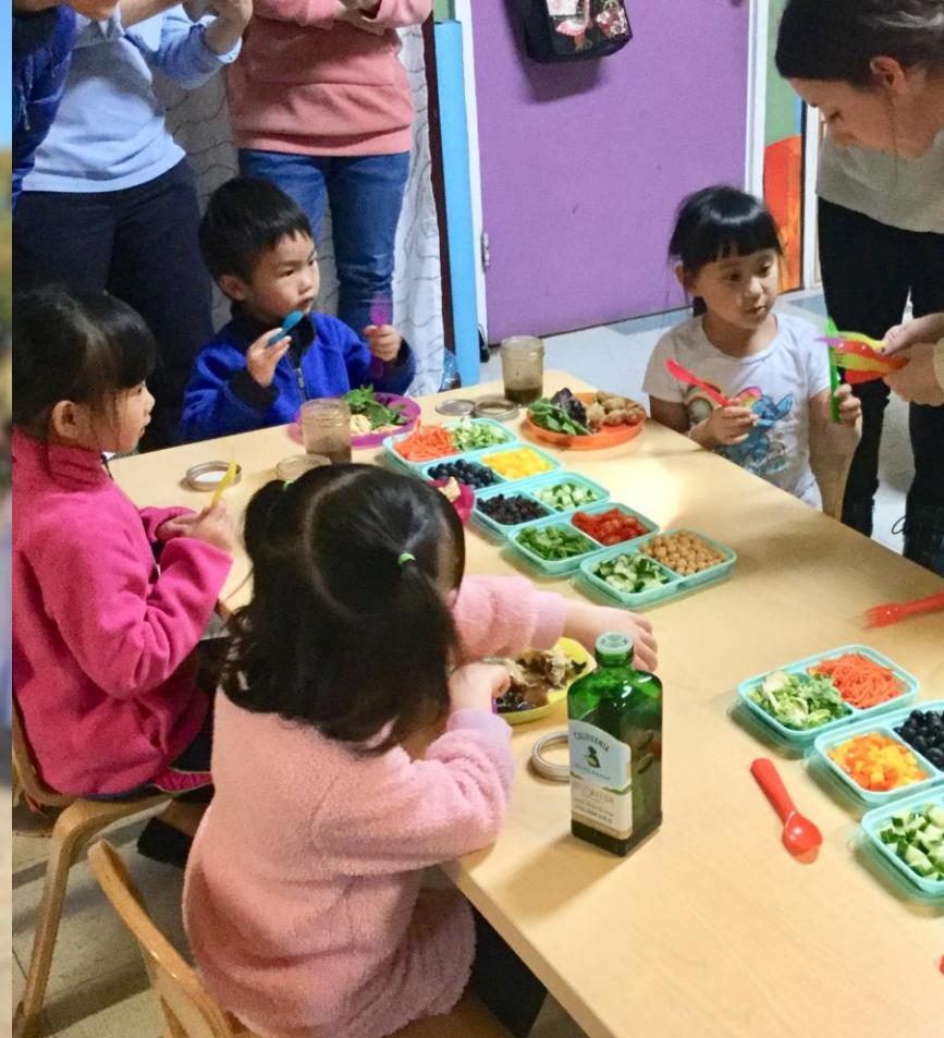
Photo credits: stock image (left); field trip with HSD Senior Meals program (middle); Farm-to-Preschools (right).