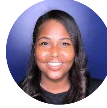
Bilan Aden #4: Community