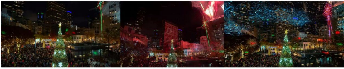
The Tree Lights (Westlake Plaza)