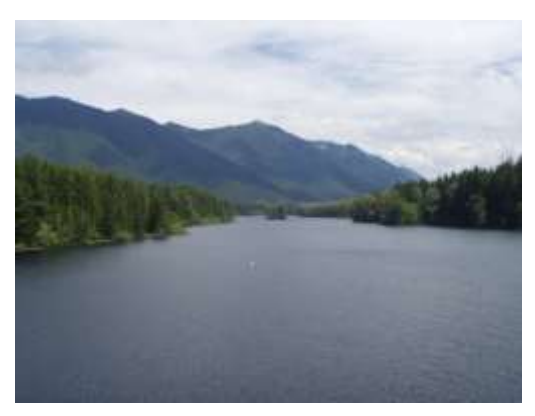
Masonry Pool Reservoir on June 16, 2013