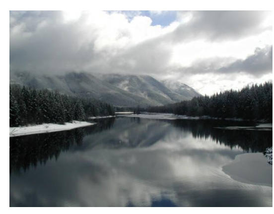
Masonry Pool Reservoir on March 3, 2013