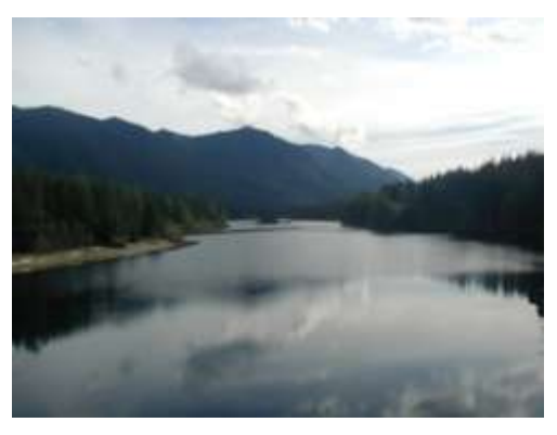
Masonry Pool Reservoir on October 2, 2011