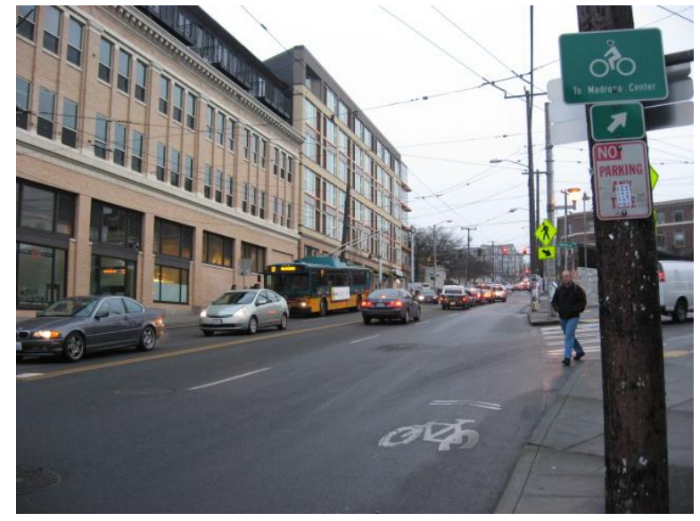
Madison St bus rapid transit corridor