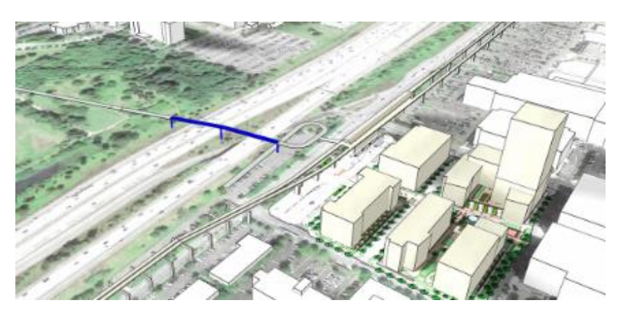
Northgate pedestrian/bicycle bridge