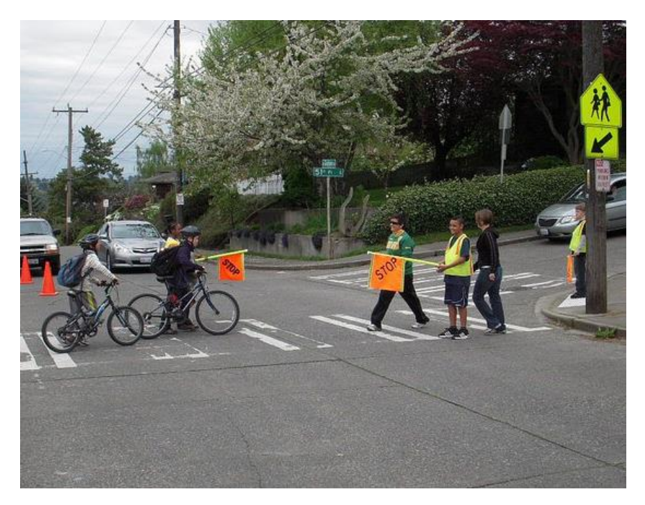
School crossing guards near Graham Hill Elementary in the Rainier Valley