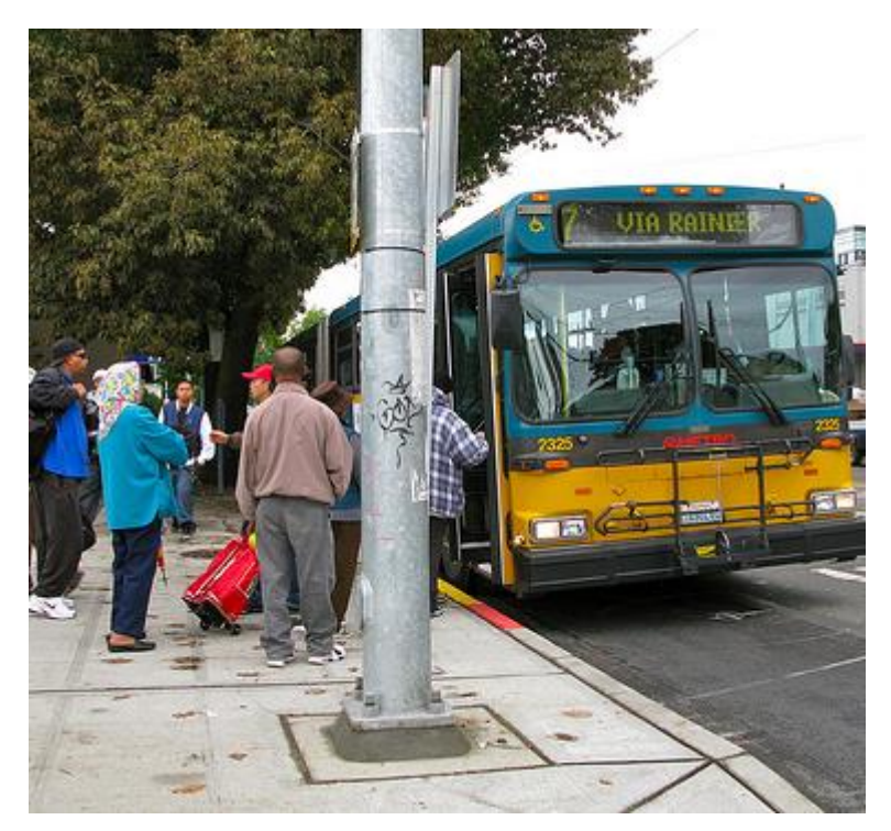
People boarding the Route 7 bus along Rainier Ave