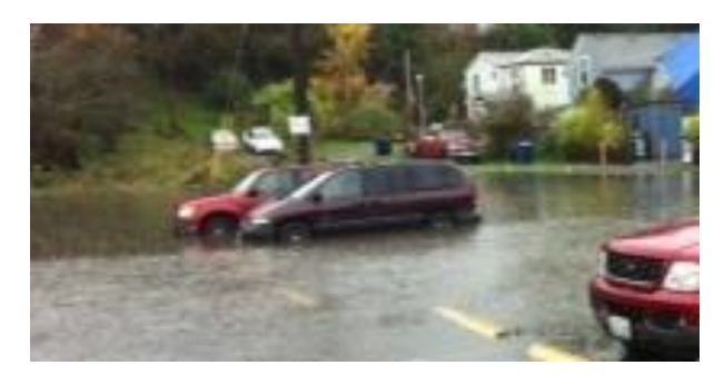
Flooding in South Park