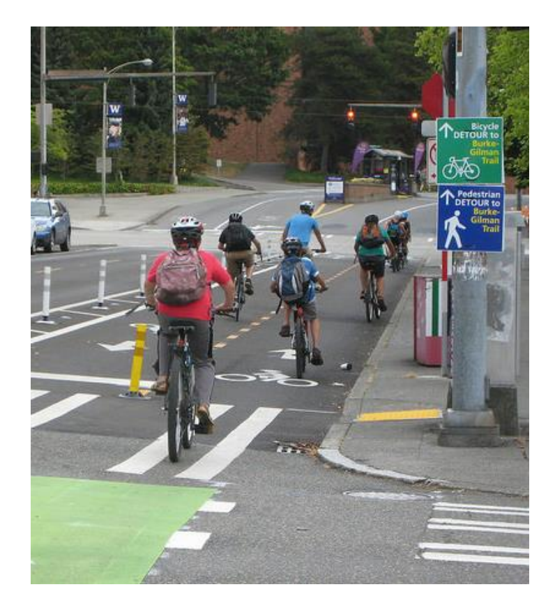
Protected bike lane in the U District