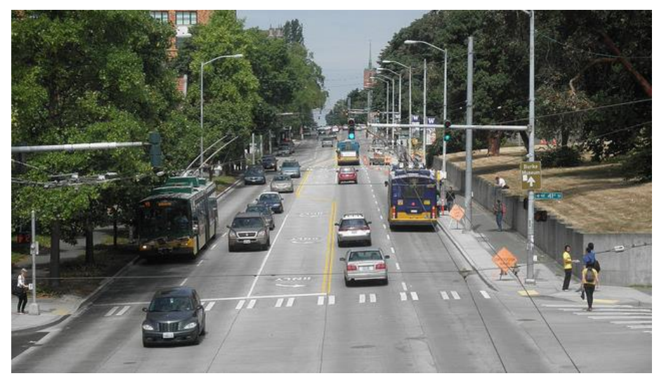
15<sup>th</sup> Ave NE paving project (completed)