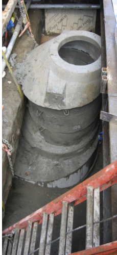
Figure 3-5 Offset MH Cone Between Two Ducts