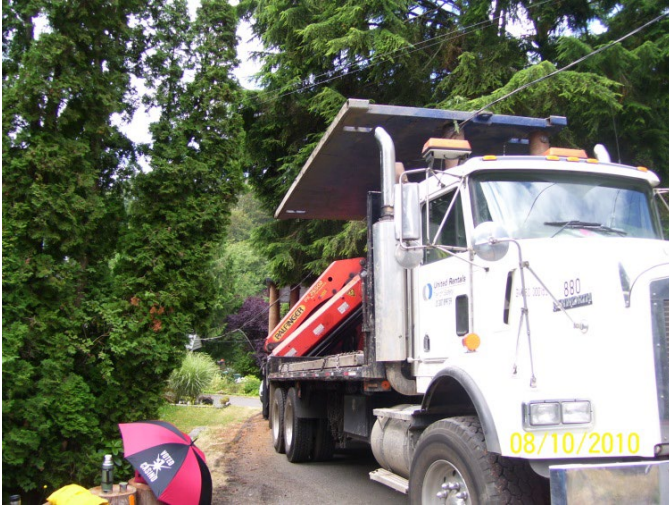
Figure 3-11 Low Electrical Service