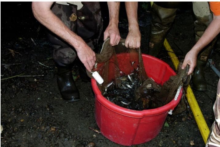
Figure 3-14 Fish Removal in Conjunction with Bypass

Work in and near streams always requires permits. The permits generally have a defined in-water construction window (aka fish window)—that is, a date-limited time when the in-water work is allowed. Obtain the permits required for in-water work prior to bidding and make meeting the fish window a clear contract requirement. Figure 3-14 shows fish removal occurring in conjunction with bypassing.