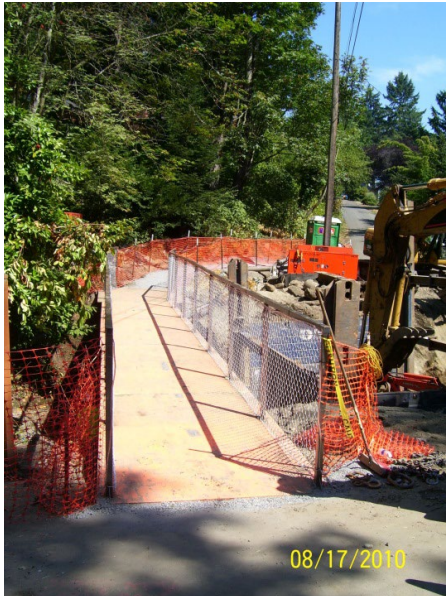
Figure 3-20 Temporary Pedestrian Bridge

Bikes. Cyclists tend to ignore detour signs; consider bike riders' safety in TCP requirements. It is difficult to detour bikes, avoid when possible.