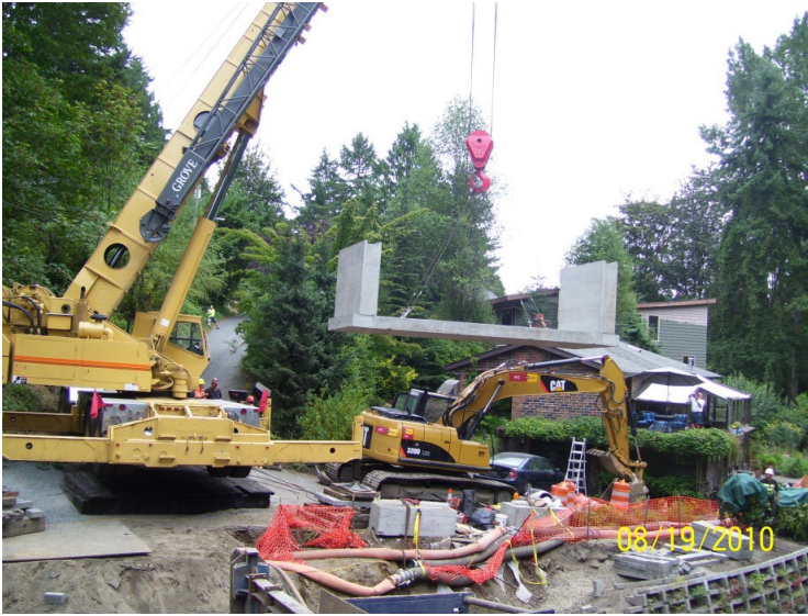
Figure 3-1 Limited Site Access

Tip: Where staging is limited and/or the project is linear, with some parts a significant distance from the staging area, consider designing with materials that can be installed or worked out of a dump truck. For example, because of staging limitations it may be more cost effective to haul out all excavated material and to backfill with imported material. Controlled density fill (CDF) placement requires the least amount of equipment.