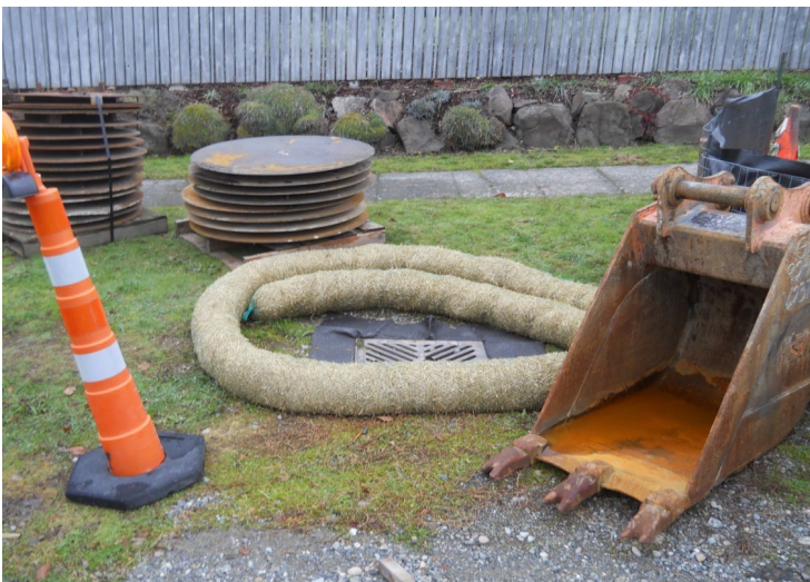
Figure 3-2 Compost Sock Around Grate Outside of Travel Lane

One common error in preparing a CSEC plan in the City is to fail to coordinate with the plan to maintain traffic and pedestrian access. See DSG section 3.16.2, Traffic Control Plans.