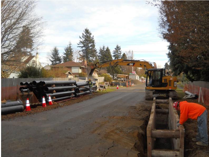
Figure 3-7 Trench Box Without Ground Support

In choosing the right shoring system the design must consider: