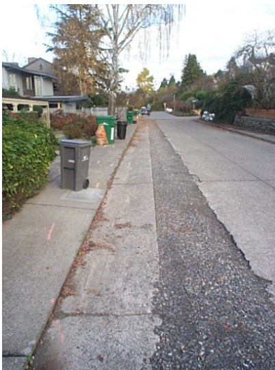
Figure 3-21 Temporary Crushed Rock Pavement