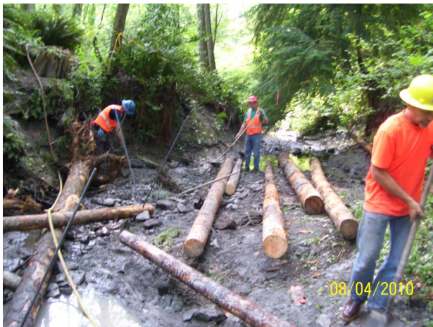
Figure 3-16 Hand-carried Logs for Stream Structure

Tip: Be sure the project is constructible, given access or equipment limitations. Clearly state these limitations in the contract documents.