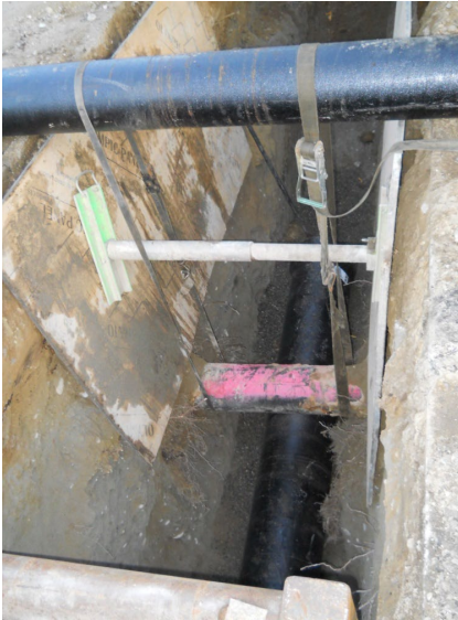
Figure 3-8 Water Main Supported with Nylon Strap