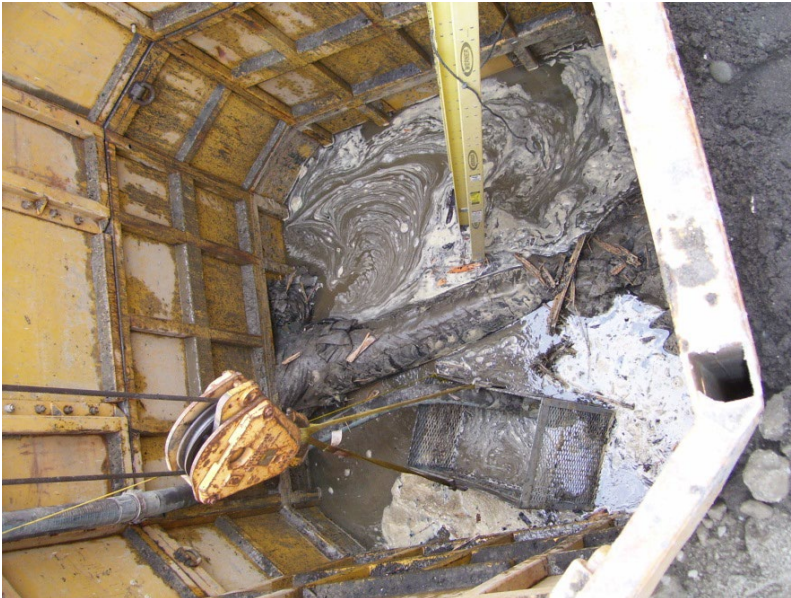
Figure 3-4 Boiling Sands Along the Duwamish

When excavating at the edge of ground water elevations, consider engineering controls to reduce groundwater pumping needs, especially for structures like MHs where a foot can make a significant difference. For example: when a MH needs to be set over an existing line, a saddle/doghouse MH can be set, the base poured in, then within the MH the existing pipe can be opened.