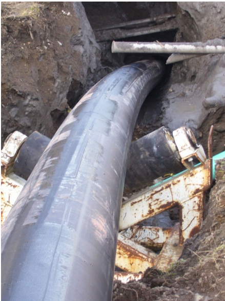
Figure 3-10 Damage and Danger to Conduit

Figure 3-10 is an example of work that should have included potholing to prevent damage to the conduit.