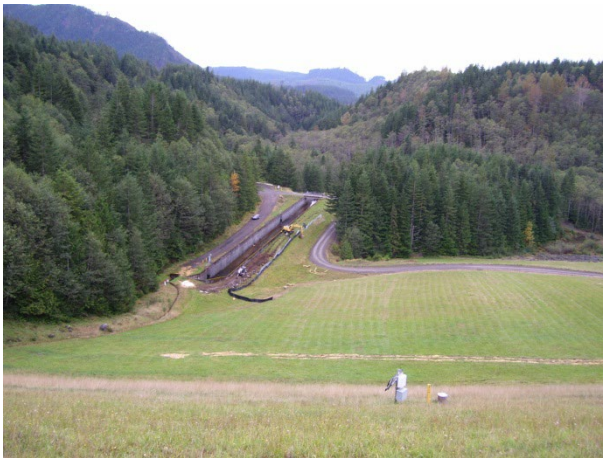
Figure 3-17 Conduit Installation on Tolt Dam Spillway in the South Fork Tolt Municipal Watershed