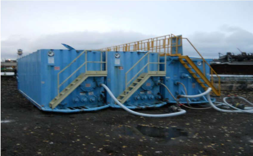
Figure 3-3 Settling Tanks Need Space

Because City projects are often located in industrial areas and roadways that may be contaminated from historical activities, SPU recommends that site sampling and testing be conducted during the design phase to determine whether contamination is present at the project site in either soil or groundwater. Treatment costs and space requirements for siting of treatment system tanks and equipment should be considered during the design phase (Figure 3-3).