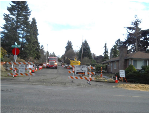
Figure 3-19 Residential Street Closure

Building access. Understand how building access will be impacted and ways to mitigate this impact, if necessary.