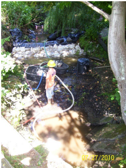
Figure 3-15 Stream Bypass Intake

Tip: For any stream bypass longer than about 50 ft, consider including intermediate pumping (and possibly discharge) locations.