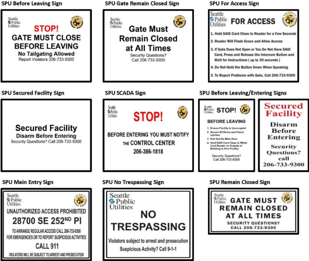
Figure 15-12 Security Signage Examples