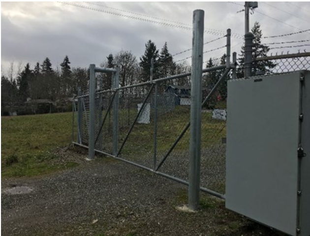
Figure 15-11 Anti-Ram Protected Gate

Figure 15-11 below is an example of anti-ram protected gates.