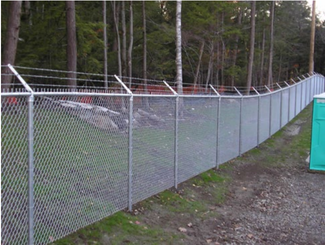
Figure 15-5 Chain-Link Fencing

Figure 15-5 below is an example of chain-link fencing protecting an SPU asset.