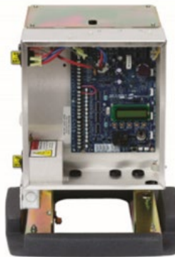
Figure 15-11 HySecurity Slidesmart HD