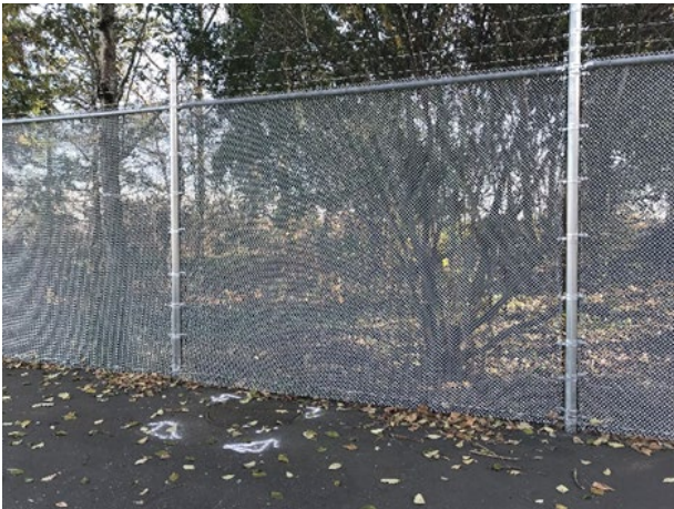
Figure 15-7 Anti-Cut and Anti-Climb Fencing

Figure 15-7 below is an example of anti-cut and anti-climb fencing protecting an SPU asset.