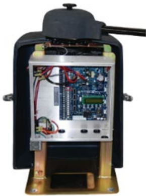
Figure 15-9 HySecurity Swingsmart DC 20