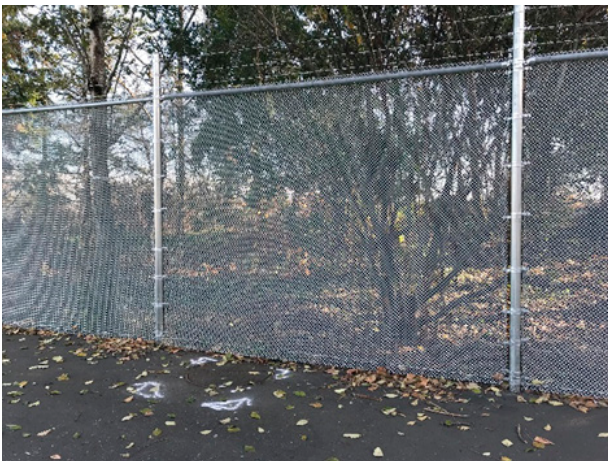
Figure 15-7 Anti-Cut and Anti-Climb Fencing

Figure 15-7 below is an example of anti-cut and anti-climb fencing protecting an SPU asset.