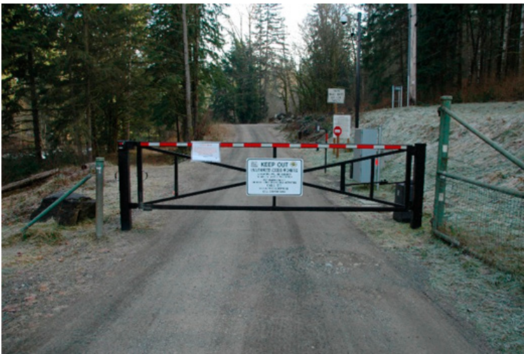
Figure 15-8 Ranch Gate

In specific circumstances to control vehicle access, the Security Department recommends ranch gates. Though not built to protect against pedestrian traffic, ranch gates are constructed using steel to deter vehicle access on restricted roads. Figure 15-8 below is an example of a ranch gate used on SPU property.