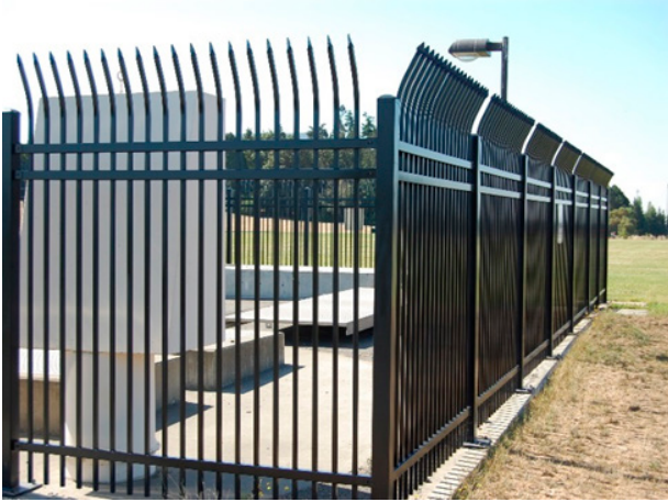
Figure 15-6 Estate Ornamental Fencing

Figure 15-6 below is an example of estate ornamental fencing protecting an SPU asset.