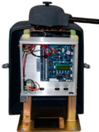
Figure 15-9 HySecurity Swingsmart DC 20