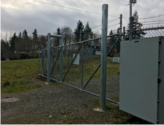
Figure 15-11 Anti-Ram Protected Gate

Figure 15-11 below is an example of anti-ram protected gates.