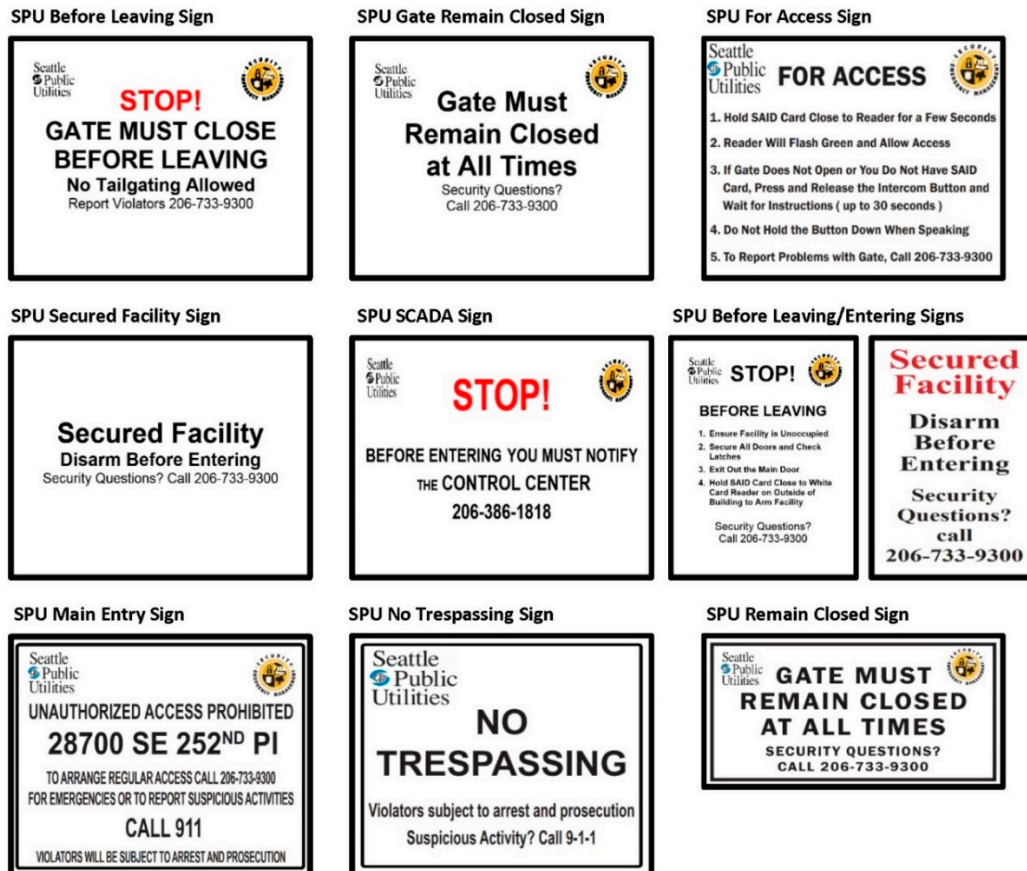
Figure 15-12 Security Signage Examples

Note: Signage should be designed in accordance with Seattle’s Sign Code (Seattle Municipal Code [SMC] 23.55).