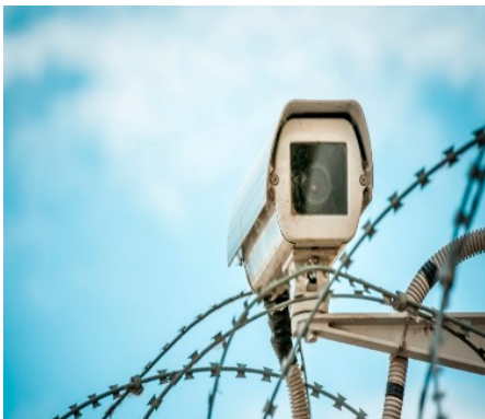
Figure 15-13 Fixed Camera