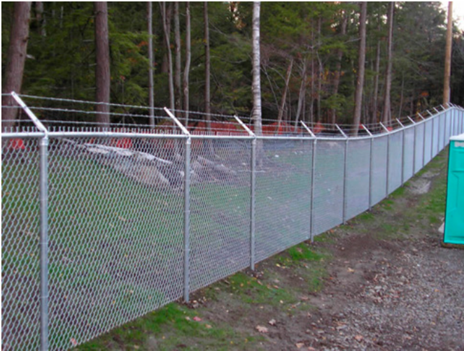
Figure 15-5 Chain-Link Fencing

Figure 15-5 below is an example of chain-link fencing protecting an SPU asset.