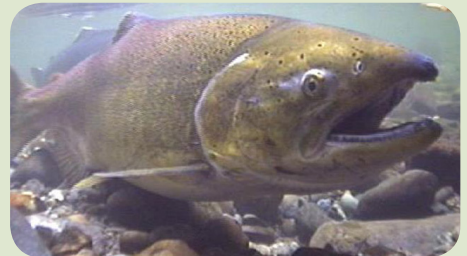
Spawning Chinook Salmon

Please do your part to protect salmon and their freshwater habitat by using water wisely, especially in the summer and fall, when the weather is dry and stream flows are at their lowest.