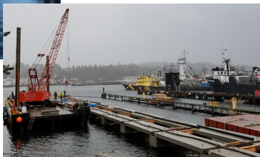
Right: A construction crew works on building the new 24th Ave NW Pier in Ballard, an early piece of the Ship Canal Water Quality Project.

For more info about the project, visit www.seattle.gov/util/shipcanalproject . Sign up for project updates at www.seattle.gov/lists/shipcanalproject.htm .