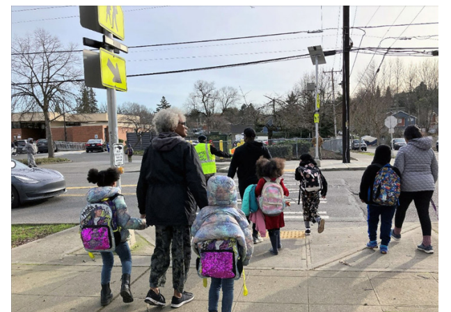
Families cross at the push button crossing beacon (S Henderson St at 50th Ave S) by South Shore PK-8

Visit our webpage to learn more and sign up for email updates