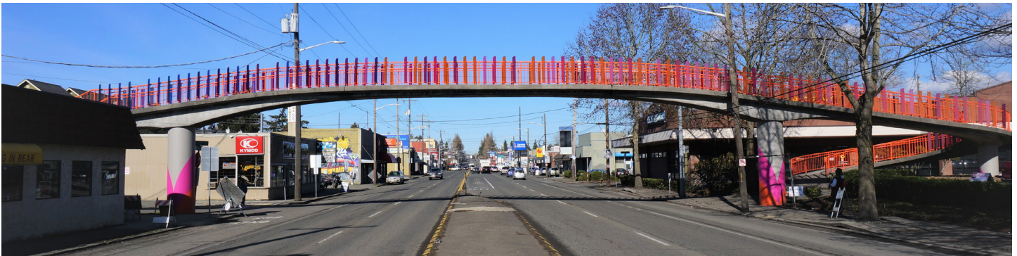
Bridge over Aurora Ave.