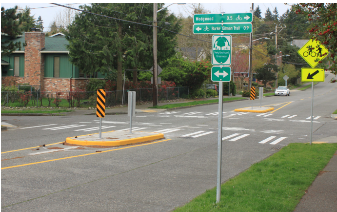
▲ Neighborhood greenway on 39th Ave NE