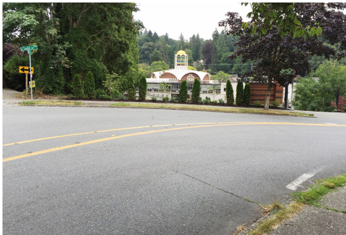
Existing conditions looking south on 19th Ave E at E Lynn St