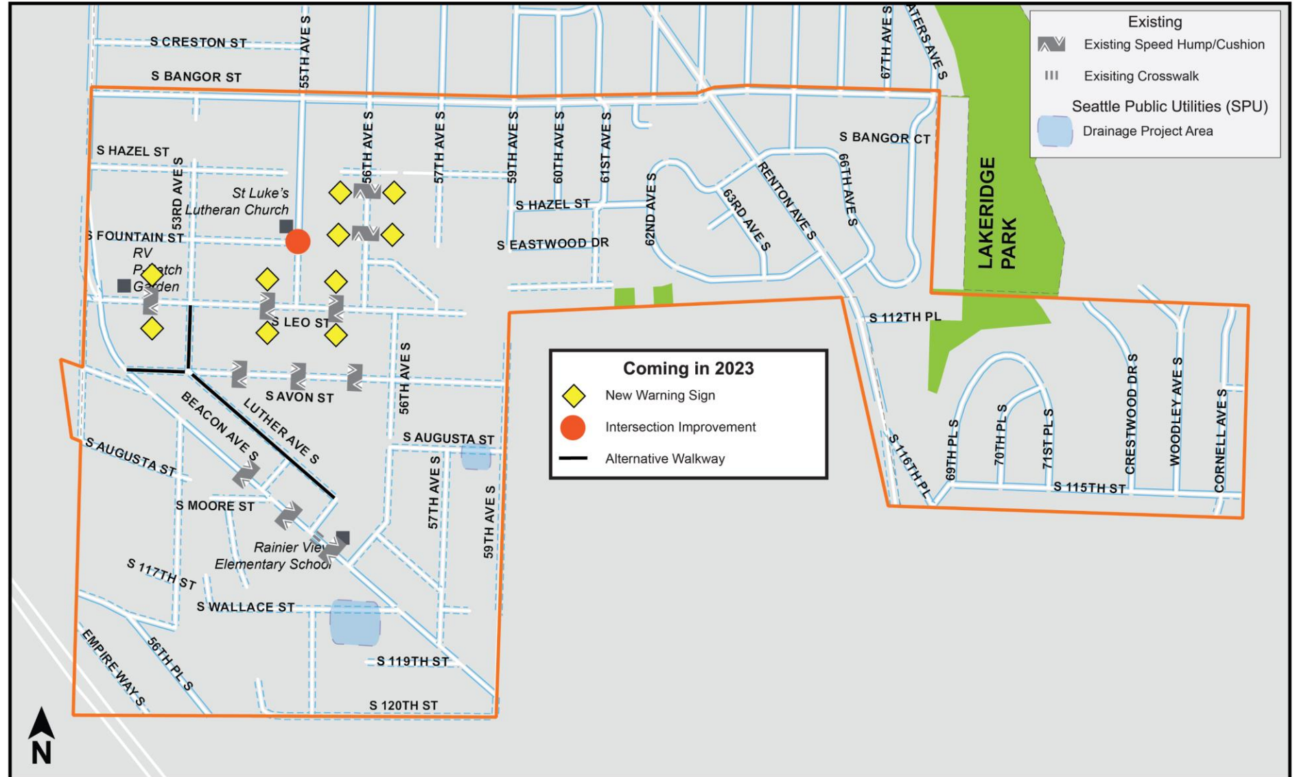
Rainier View Draft Home Zone - Projects for 2023 Construction