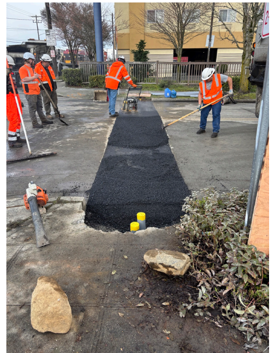
Crews lay asphalt on Aurora Ave N and N 137th St to prepare for new crosswalks and crossing signals