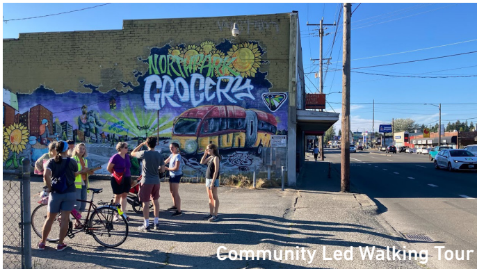
Community Led Walking Tour

After the walks, Aurora-Licton residents formed a steering committee. The steering committee developed the Draft Home Zone. We expect construction to begin in late 2024 and 2025.