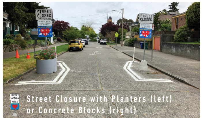
Street Closure with Planters (left) or Concrete Blocks (right)

The Healthy Streets along Fremont Ave, Ashworth Ave, and 100th St are under review to become permanent. We are working on a conceptual design based on what we have heard from the community. Because Healthy Streets are already closed to through traffic, you don't need a permit from the City of Seattle to host a Play Street. Get materials to enhance the closure and learn more on the Healthy Streets website.