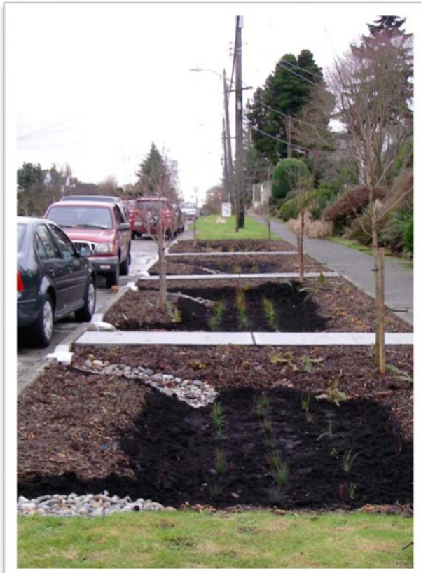
30th Ave NW – December 2010