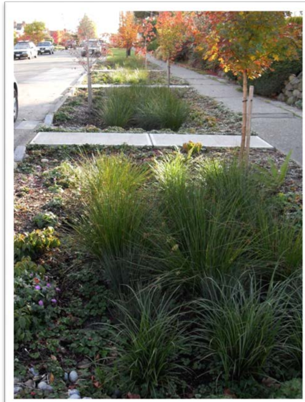
30th Ave NW – November 2011