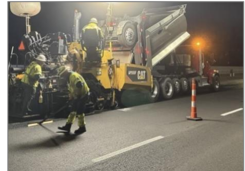
Example of road surface being paved.