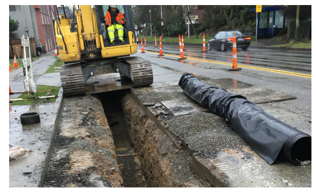
Work to replace the 100-year-old water main is complete