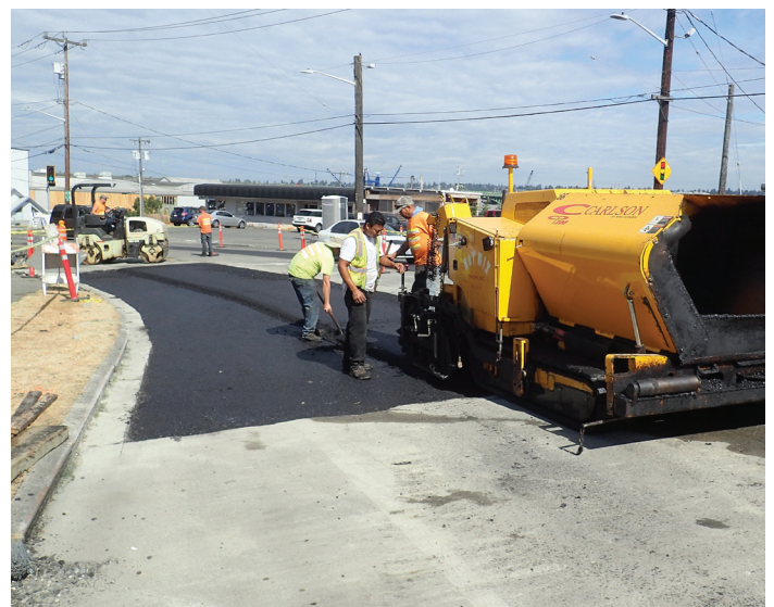
An example of crews paving

During grinding and paving work, restrictions to entering and exiting garages on 6th Ave will be necessary. While some sections may take two days to fully grind and pave, most garages and buildings will only be impacted 2 nights. Grinding can also move quickly along 6th Ave, and so access may not need to be restricted the full night. We are working with all buildings and garages on 6th Ave to plan for this work.