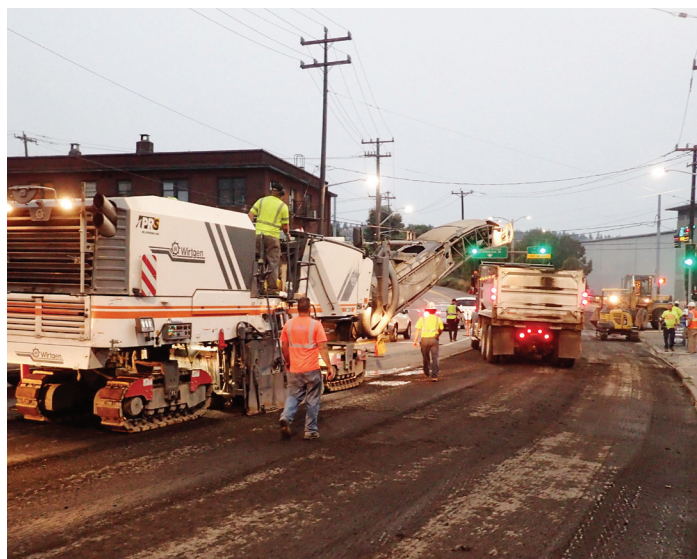
An example of crews grinding

Grinding and paving work will occur at night, between 7 PM and 5 AM. This allows crews to get work done quickly and reduce impacts to people moving around downtown during the day.