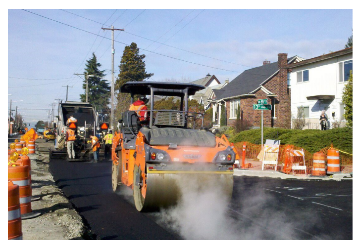
Example of crews completing a mill and overlay paving project

and major access impacts as work progresses along the corridor. Our goal is to work with the community to limit construction impacts to the extent feasible.