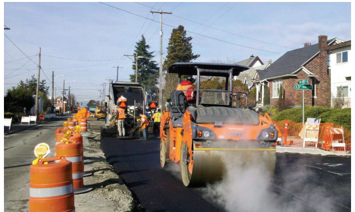
Example of crews completing a mill and overlay paving project.

Construction is scheduled to begin as early as Monday, July 24, and will take approximately 6 months to complete, weather permitting. The project area is divided into 3 work zones and we will require crews to finish major construction in one zone before moving to the other. Crews will complete work in front of a given property in shorter phases to maximize efficiency and reduce individual impacts as much as possible.