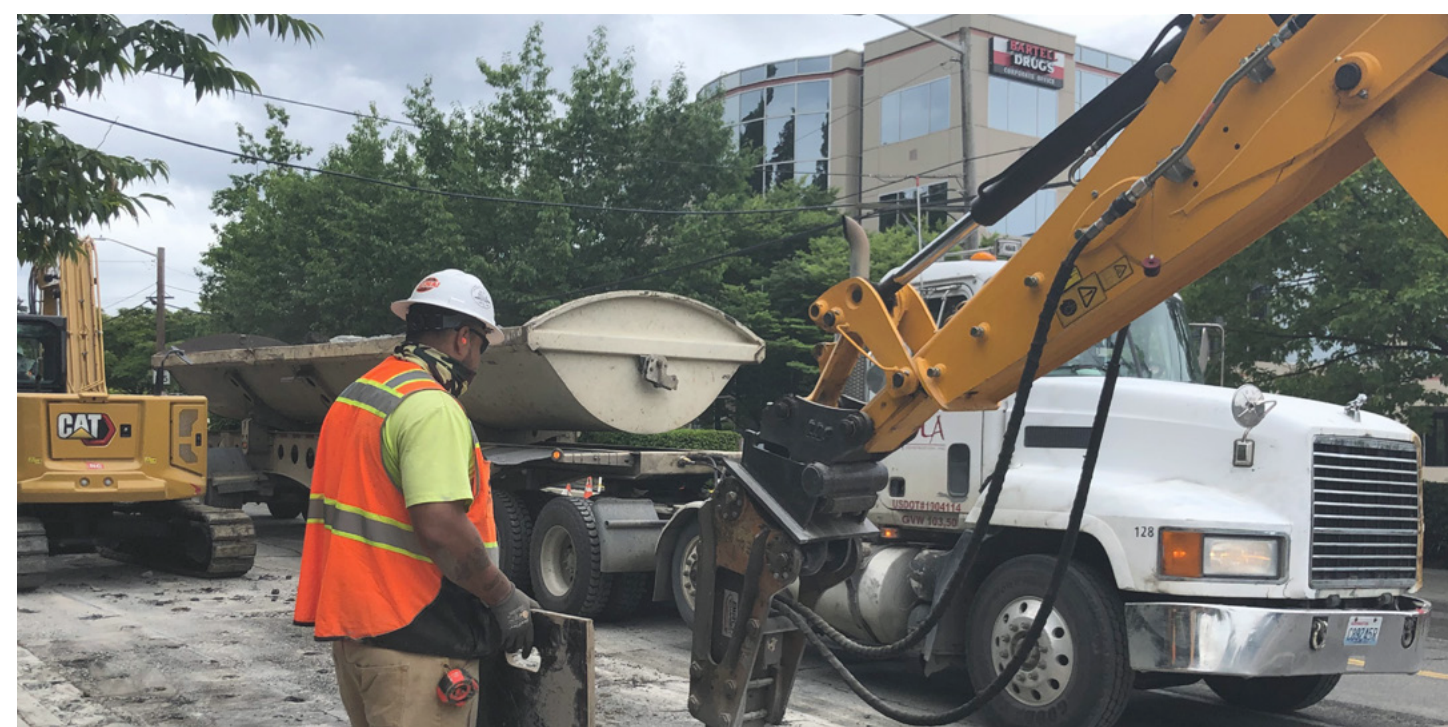
Construction worker prepares the roadway for resurfacing