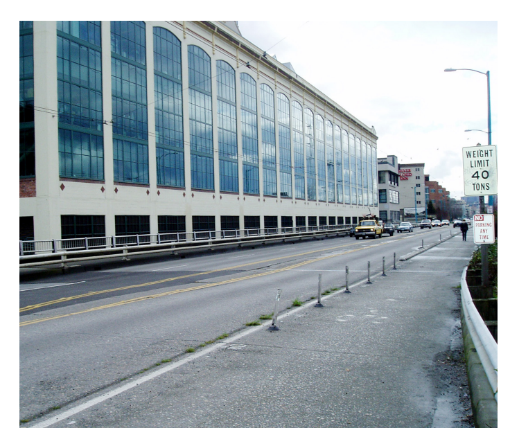
Fairview Ave N bridge directly next to the historic Lake Union Steam Plant Building (currently Zymogenetics).

The total project cost estimate is $42 million. The project is funded in three ways: Bridging the Gap, a nine-year levy for transportation maintenance and improvement, federal funding through the Bridge Replacement Advisory Committee (BRAC), and funds from the Levy to Move Seattle.