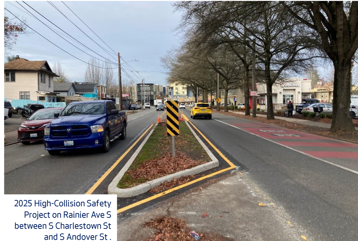
2025 High-Collision Safety Project on Rainier Ave S between S Charlestown St and S Andover St .