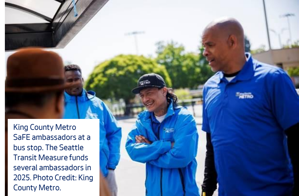
King County Metro SaFE ambassadors at a bus stop. The Seattle Transit Measure funds several ambassadors in 2025.