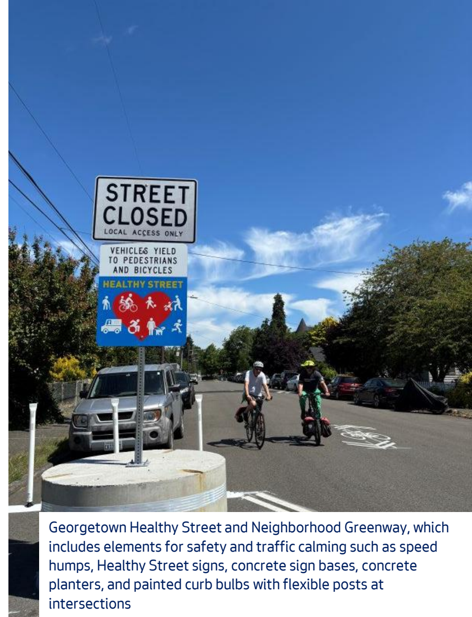
Georgetown Healthy Street and Neighborhood Greenway, which includes elements for safety and traffic calming such as speed humps, Healthy Street signs, concrete sign bases, concrete planters, and painted curb bulbs with flexible posts at intersections