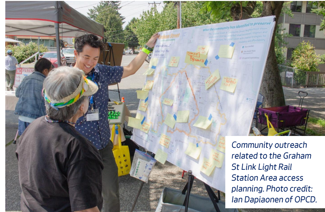
Community outreach related to the Graham St Link Light Rail Station Area access planning.