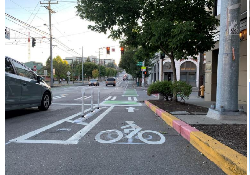
Transit spot improvement for bicycle safety at Westbound Yesler Way and 14th Ave