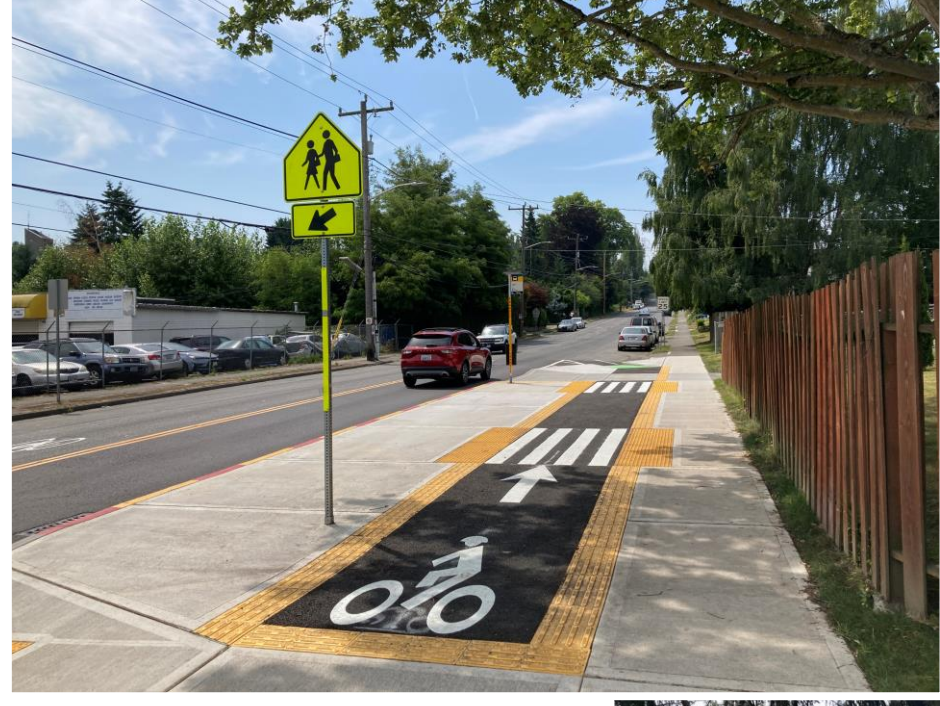
51st Ave S and Renton Ave S Traffic Safety Enhancements (Neighborhood Street Fund)