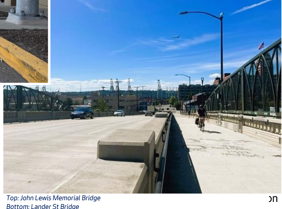
Bottom: Lander St Bridge