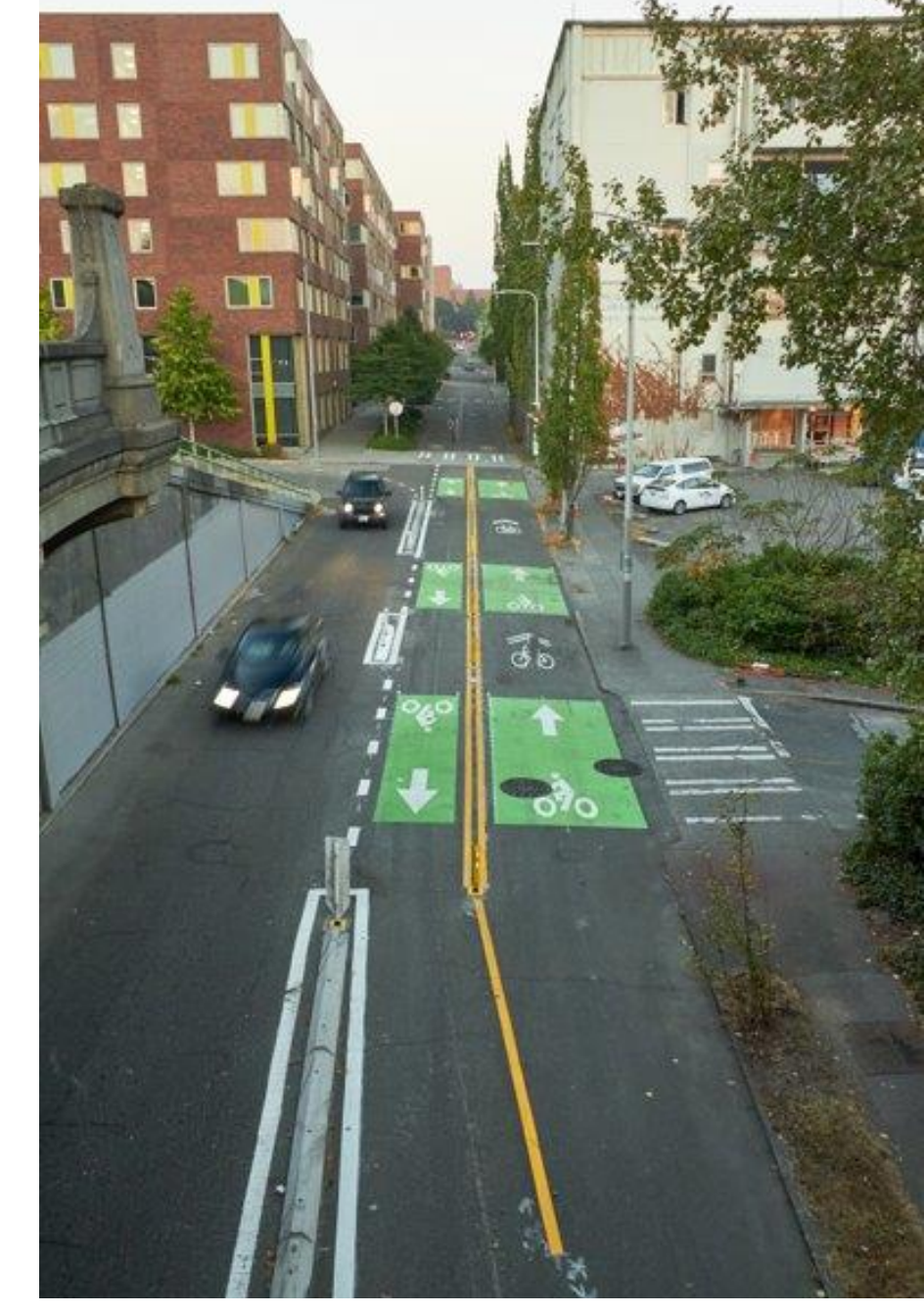
Bike spot improvement/barriers on N 40th St.

2015 Levy Ordinance: Install 1,500 new bicycle parking spots citywide and maintain existing bike facilities. Install other biking and walking investments.