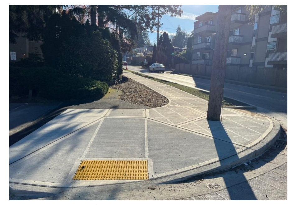
New sidewalks on N 95<sup>th</sup> St.