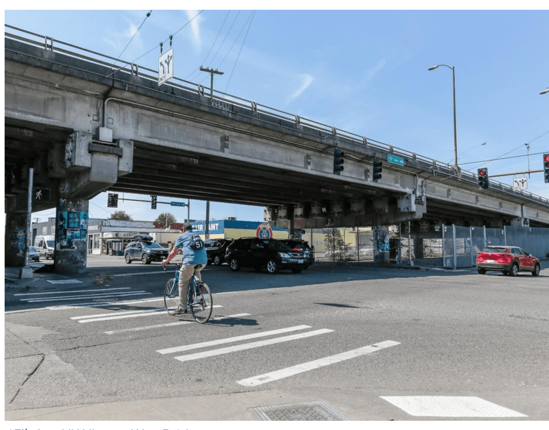
15th Ave NW/Leary Way Bridge