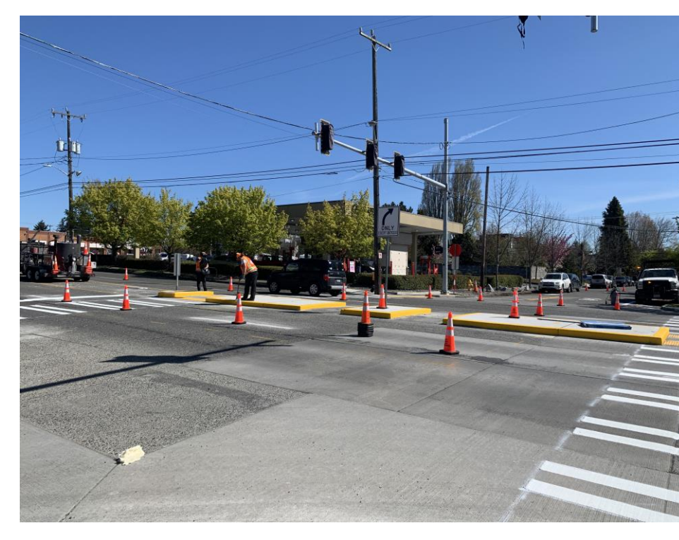
15<sup>th</sup> Ave NW & NW 83<sup>rd</sup> St Pedestrian Safety Enhancements NSF project under construction