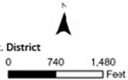
DOWNTOWN ZONING Map 1J Public Amenity and Other Features