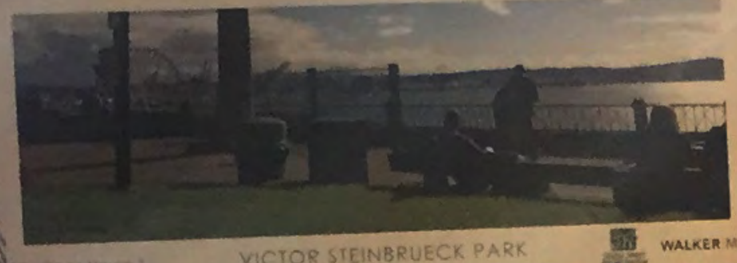
VICTOR STEINBRUECK PARK WALKER MACY