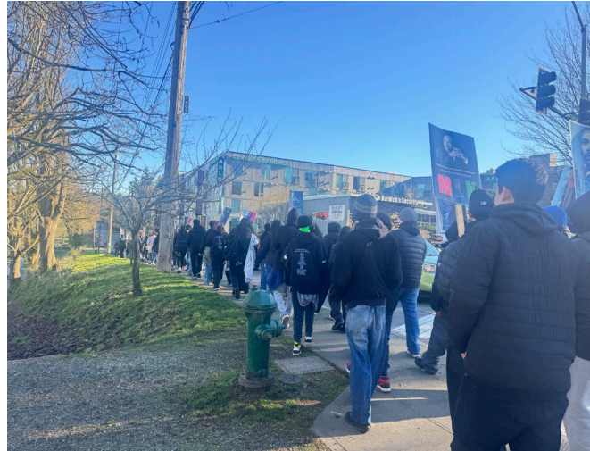
Youth-led Martin Luther King, Jr. Day of Celebration