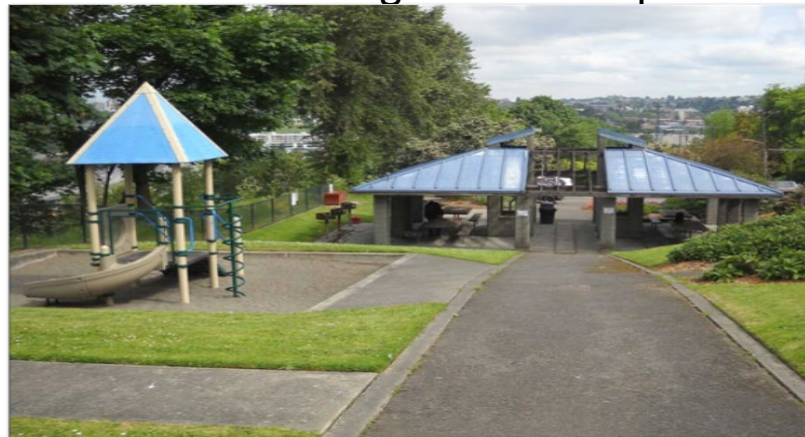
Dr. Jose Rizal Park