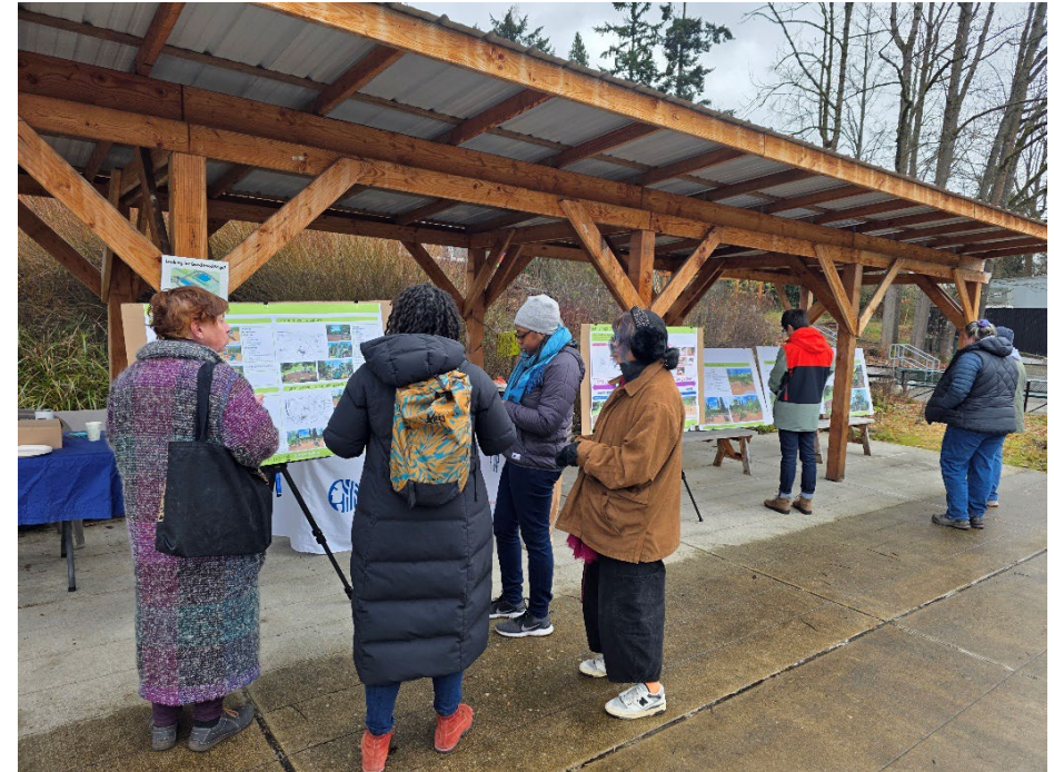
Be'er Sheva Play Area Phase II Renovation community engagement