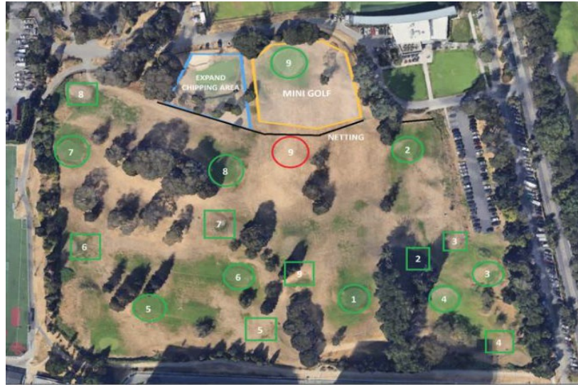
First Tee at Bill Wright Golf Complex