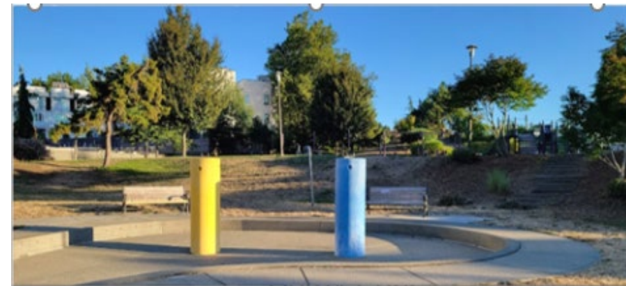
Judkins Park Inclusive Playground and Spray Park