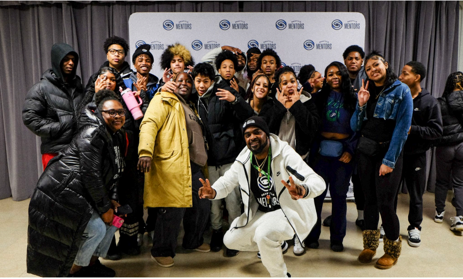
Empowerment Exchange Fall Pilot