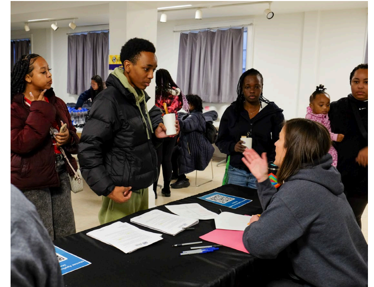
Visionary Voices: Igniting Your Potential