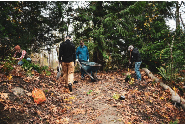
Cheasty Mountain Bike/Pedestrian Trail Pilot Project