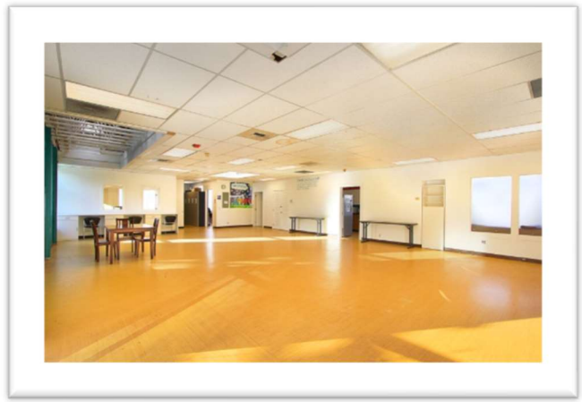
Interior-Cascade People's Center

WOMEN AND MINORITY BUSINESSES ARE ENCOURAGED TO SUBMIT A PROPOSAL