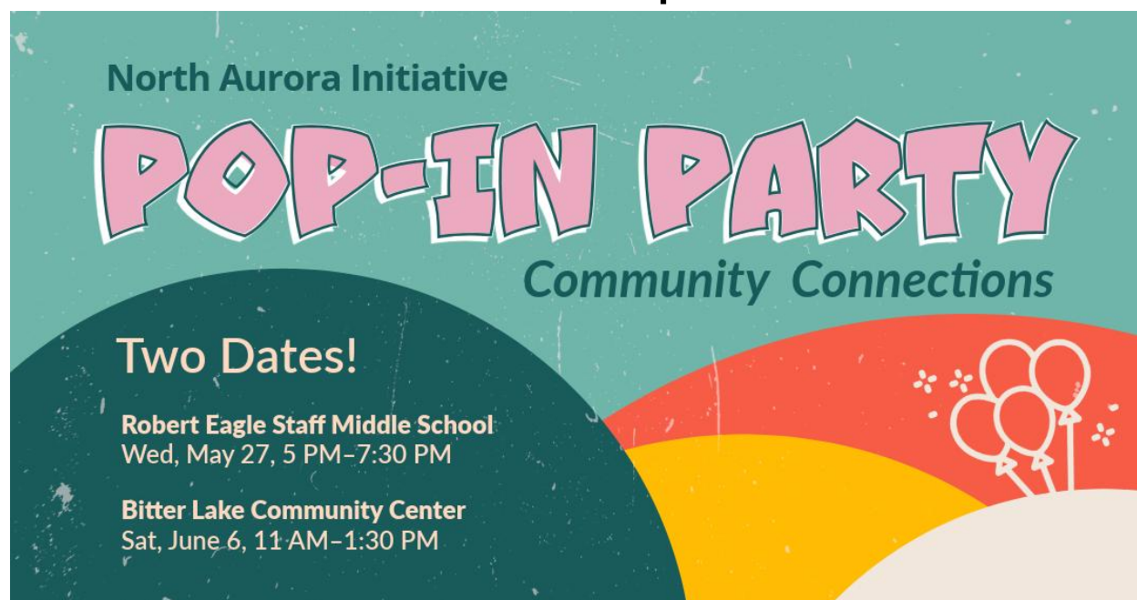
Figure advertising the North Aurora Initiative Pop-In Party Community Connections occurring over two dates, one at Robert Eagle Staff Middle School on Wednesday, May 27 th from 5 PM to 7:30 PM and one at Bitter Lake Community Center Saturday, June 6 th from 11 AM to 1:30 PM.