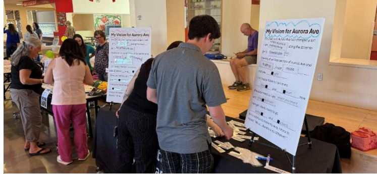
Two visitors in the foreground working on a “My Vision for Aurora Ave” poster, in which they insert words into sentences about the future, while other visitors hold discussion in the background