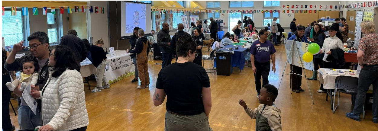
In the Bitter Lake Community Center event showing approximately 40 people across different stations discussing various topics with City staff and community organizations