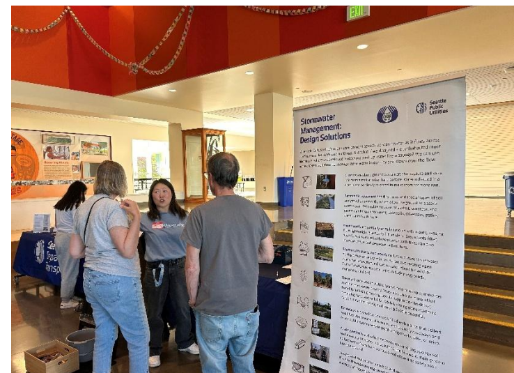
On the right, the “Stormwater Management: Design Solutions” poster while two attendees discuss with SPU staff on the left