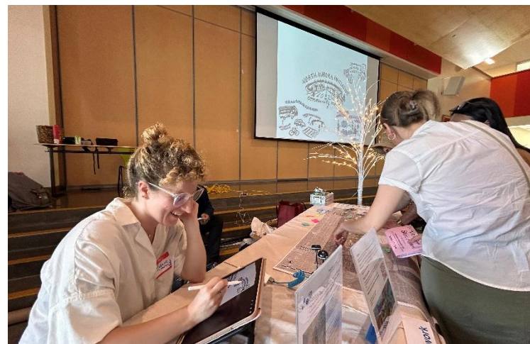
The live artist working to sketch out community conversations between two neighboring individuals with the sketch projected onto the wall in the background