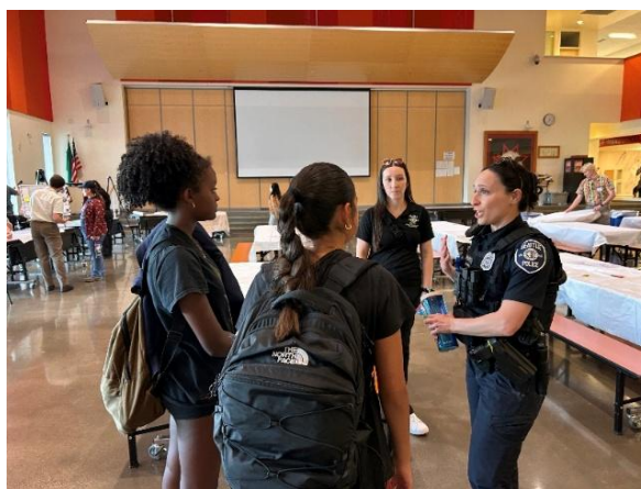
Attendees talking with a uniformed Seattle Police Department officer