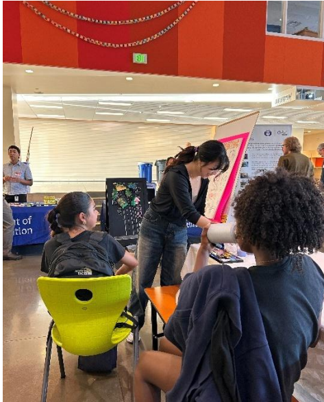
Two attendees receiving face paint