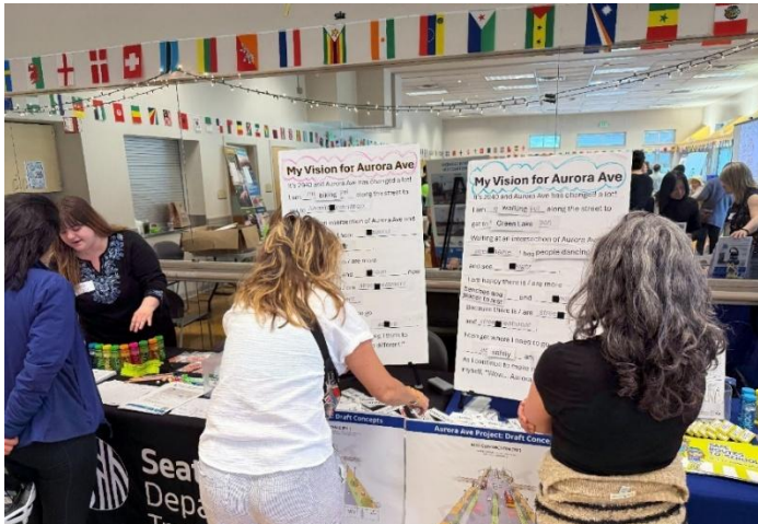
Two visitors in the foreground on a "My Vision for Aurora Ave" poster