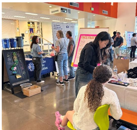
Attendees receiving face paint in the foreground while others discuss wastewater management with City staff in the background

The live art topics recorded via illustration at the Robert Eagle Staff Middle School. Using a mixture of illustrated graphics and images, these topics including transportation, safe routes, buses, natural space, tree canopy, community health and safety, cafes, community spaces, housing that is a mixture of single family and higher density.