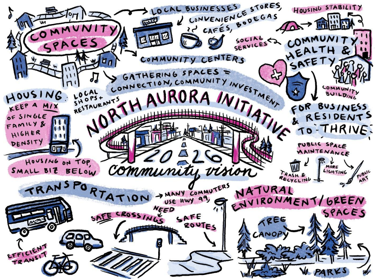
ROBERT EAGLE STAFF MIDDLE SCHOOL · 5/27/26 · VISUAL NOTES by NATALIE DUPILLE

The live art topics recorded via illustration at the Robert Eagle Staff Middle School. Using a mixture of illustrated graphics and images, these topics including transportation, safe routes, buses, natural space, tree canopy, community health and safety, cafes, community spaces, housing that is a mixture of single family and higher density.