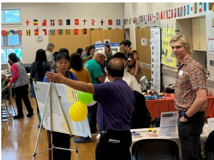
Two City staff welcome an attendee while others discuss their tables with attendees in the background