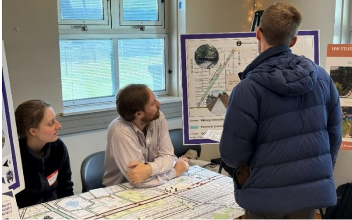
University of Washington students discussing their ideas for transportation interventions with an attendee