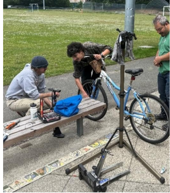
A University of Washington student works on a bike tune up with an attendee on either side